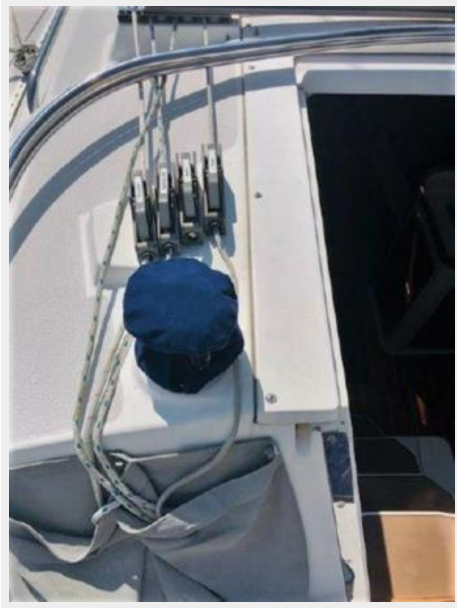
Portside Line Clutches