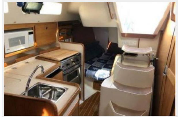
Galley, Aft Cabin Entry & Companionway