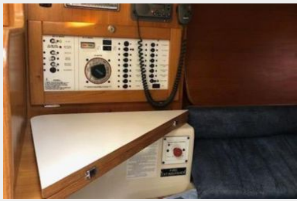
Electric Panel inside Aft Cabin