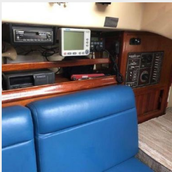
Instruments & Electric Panel