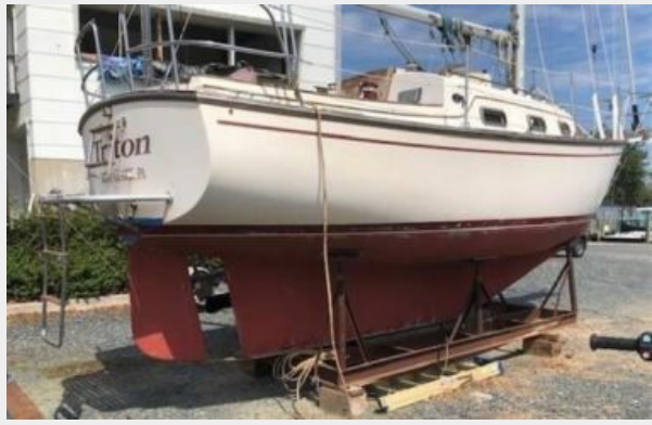
Starboard Stern & Transom & Swim Platform