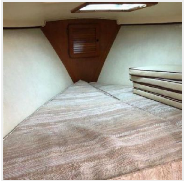
Spacious Vee Berth with overhead Hatch