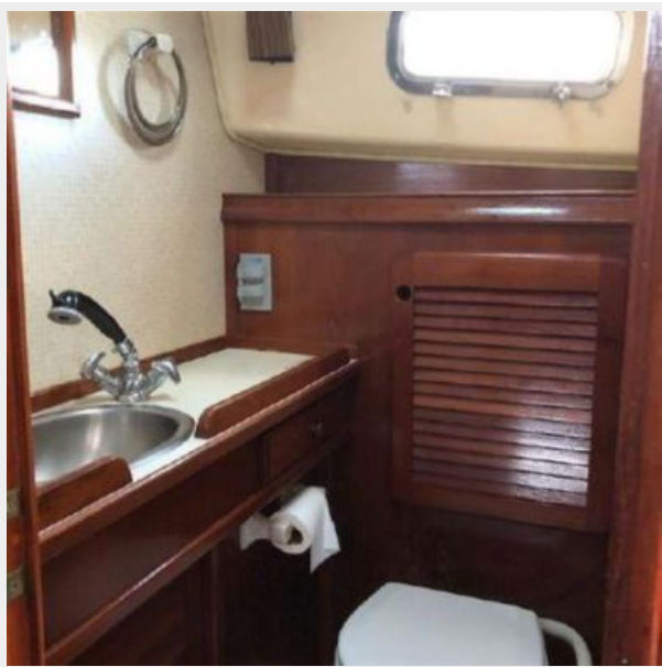
Big Well Ventilated Head