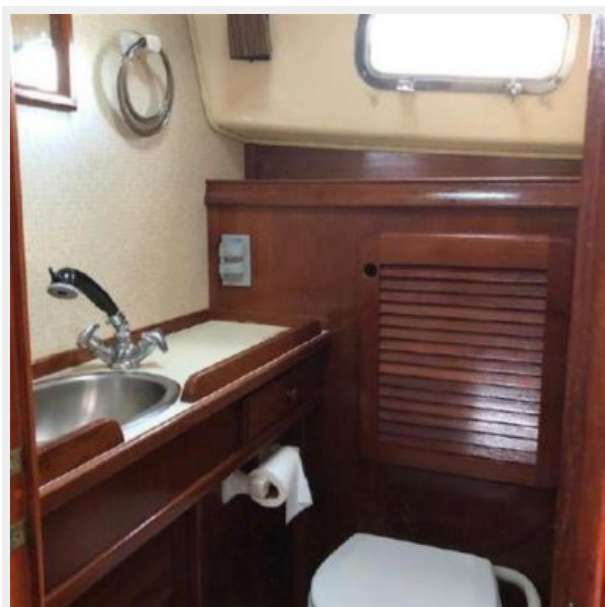
Big Well Ventilated Head