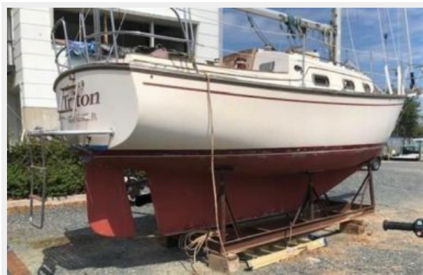
Starboard Stern & Transom & Swim Platform