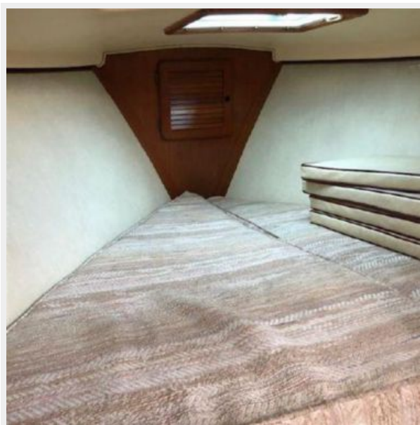
Spacious Vee Berth with overhead Hatch