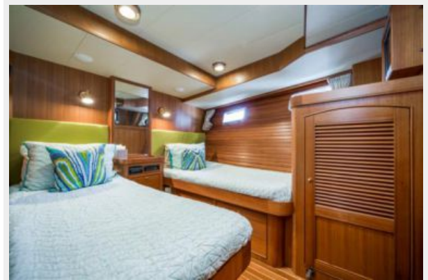
Guest 1 1