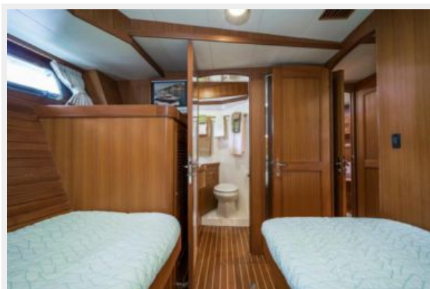
Guest 1 2