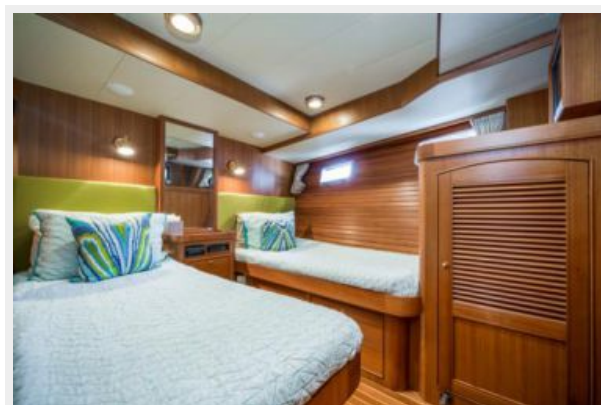
Guest 1 1