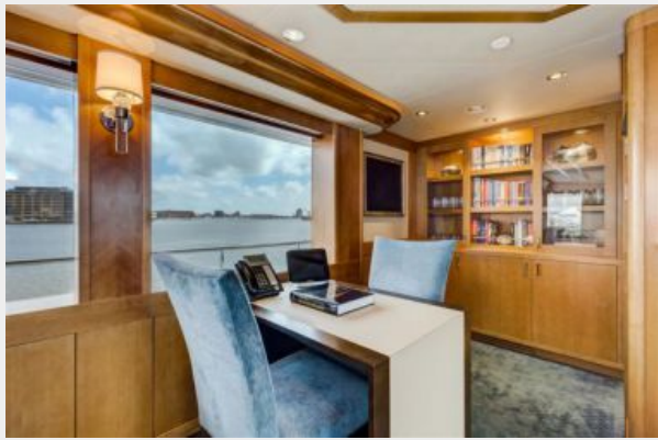
Sky Lounge Office