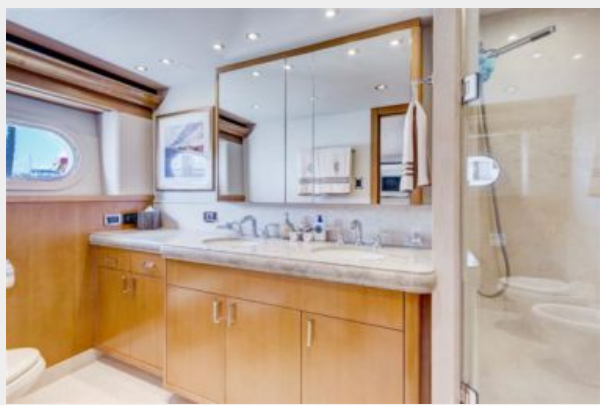
Guest VIP 2 Bath