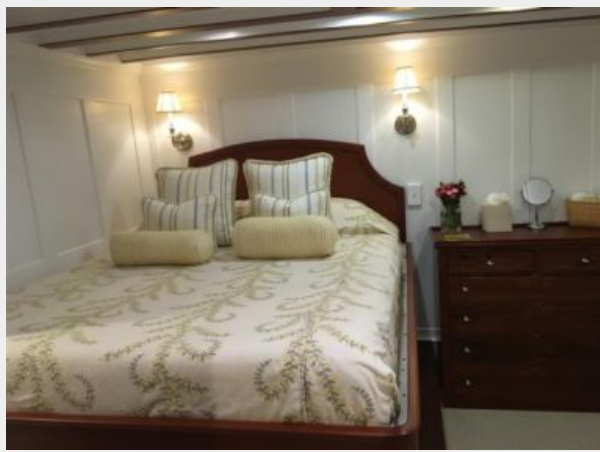
Guest Queen Stateroom