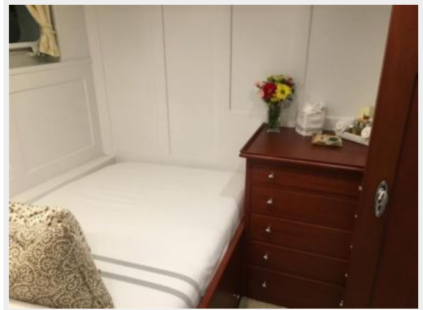
Guest Double Stateroom