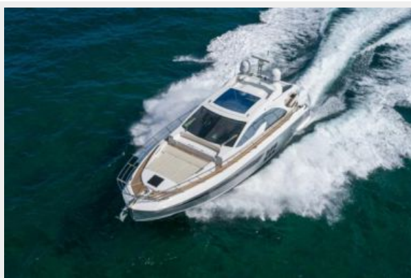
Aerial View of the Boat