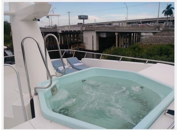
Sun Deck - Jacuzzi