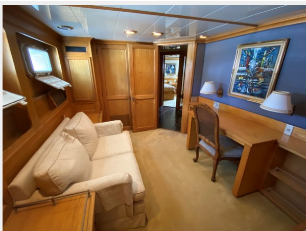
Starboard Stateroom - Forward