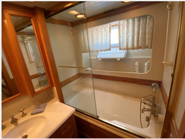
Starboard Bathroom - Forward