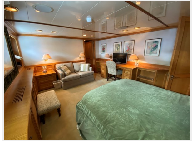
Port/VIP Stateroom - Forward