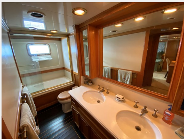
Port/VIP Bathroom - Forward