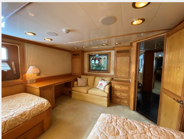
Port Stateroom - Aft