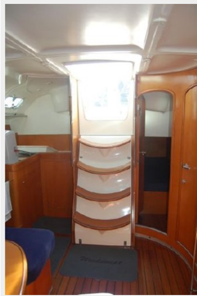
Looking aft towards stairs to cockpit, midcabin stateroom