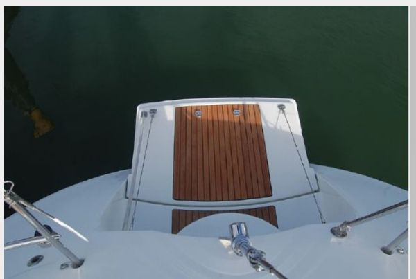
Folding transom platform