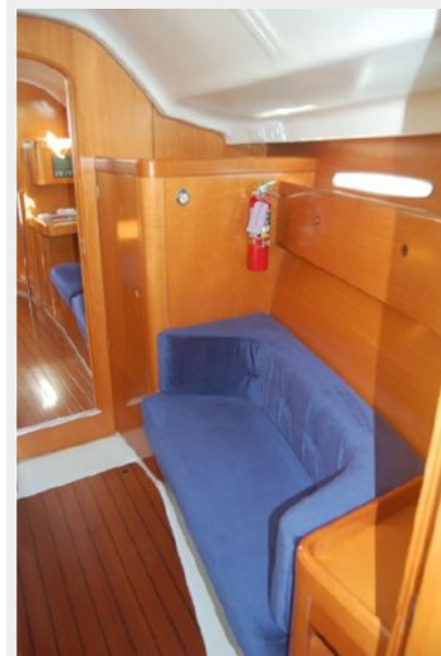
Forward Stateroom settee