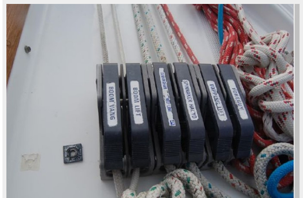
Line organizers, brakes, sheaves