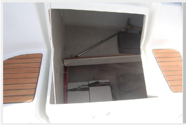
Cockpit Storage starboard