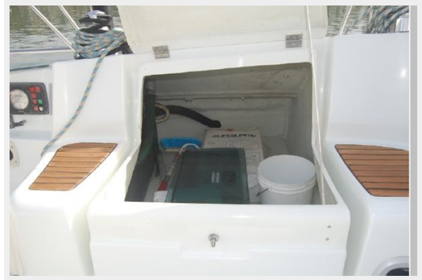
Cockpit Storage port