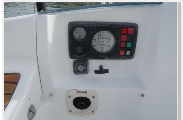
Engine gauges / alarms