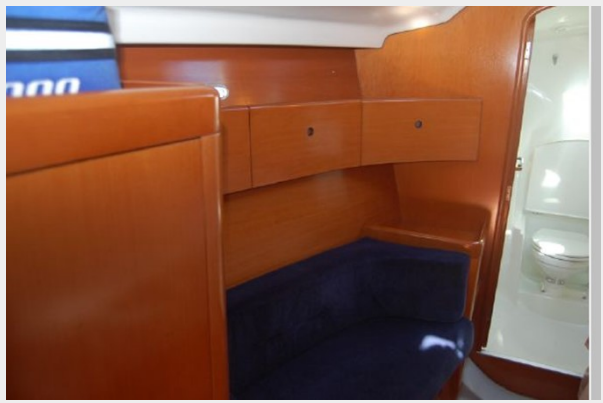
Forward Stateroom looking forward