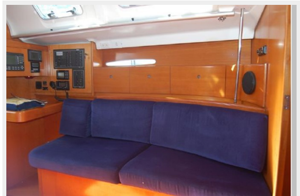
Salon settee, Navigation station