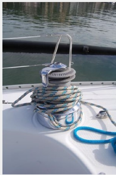
Lewmar Winches, sheets