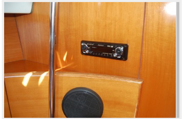
Stereo w/ speakers