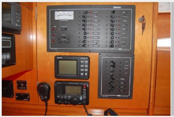
DC / AC Electrical panels, Auto Pilot, VHF radio