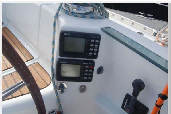
Cockpit Auto Pilot, GPS