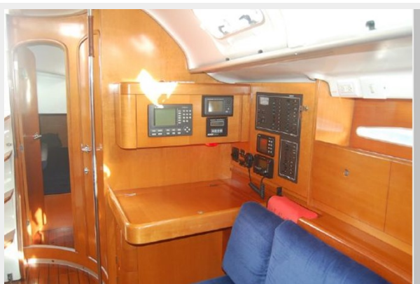
Cabin Navigation station