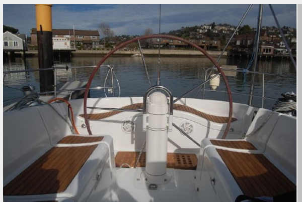
Cockpit looking aft