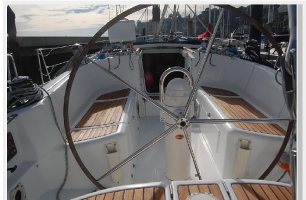
Wheel and cockpit forward