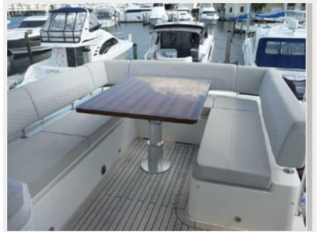
Aft Bridge Seating