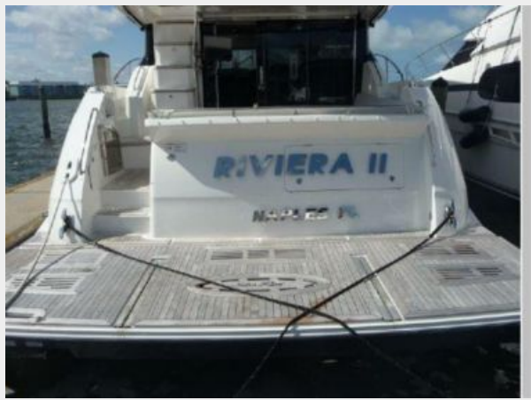
Hyd. Marine lift and swim platform