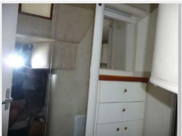
Guest closet and Vanity