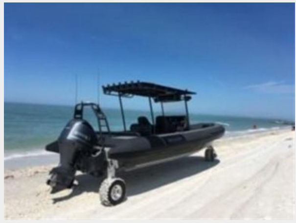
Ext Stern View