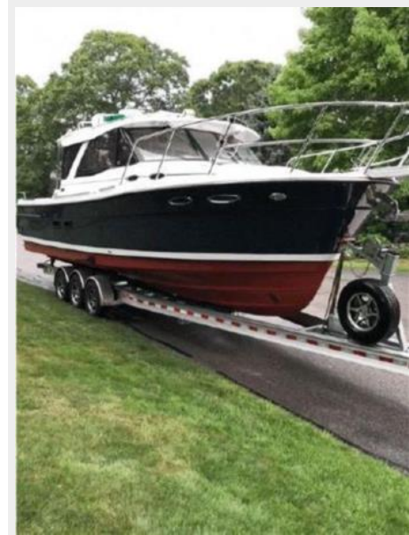
Boat and trailer