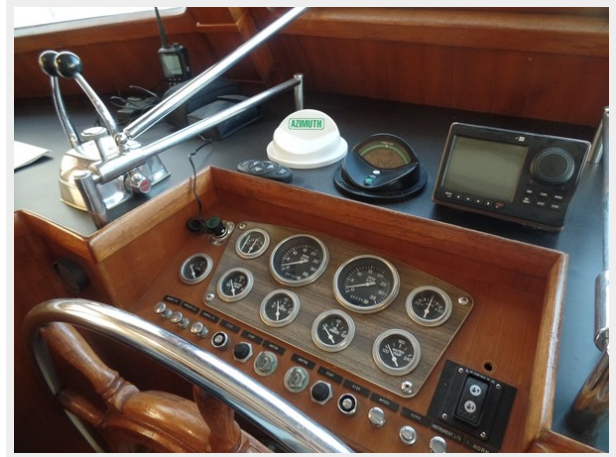
Mujuk Marine Trader 1984 Walkaround Helm