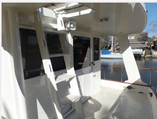
Mujuk Marine Trader 1984 Walkaround Aft Deck