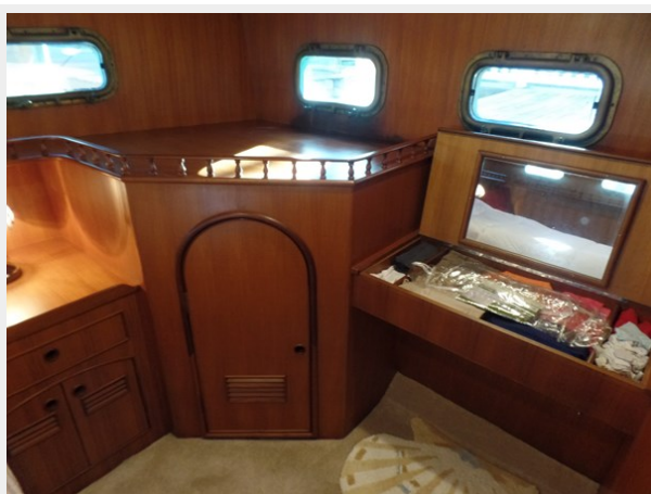
Mujuk Marine Trader 1984 Walkaround Master Stateroom (4)