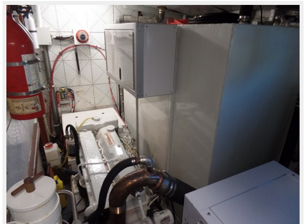
Mujuk Marine Trader 1984 Walkaround Stbd Engine Room (2)