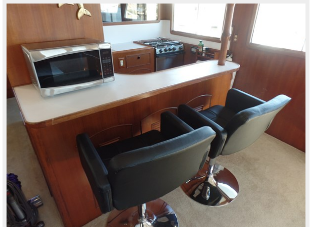
Mujuk Marine Trader 1984 Walkaround Bar Stools