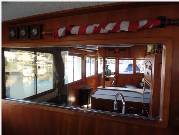
Mujuk Marine Trader 1984 Walkaround Helm facing Aft