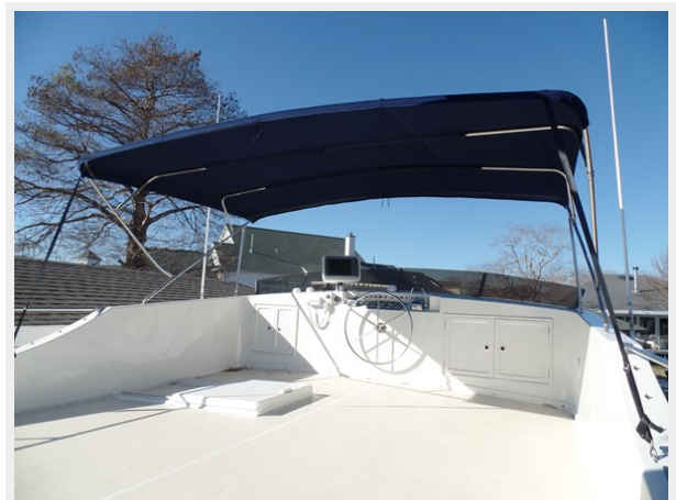
Mujuk Marine Trader 1984 Walkaround Bridge