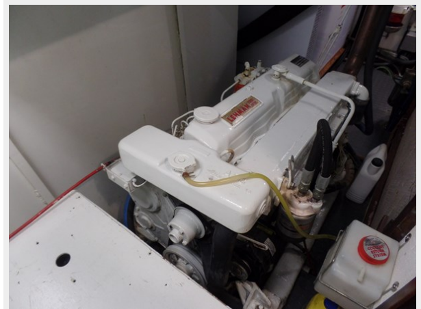
Mujuk Marine Trader 1984 Walkaround Stbd Engine