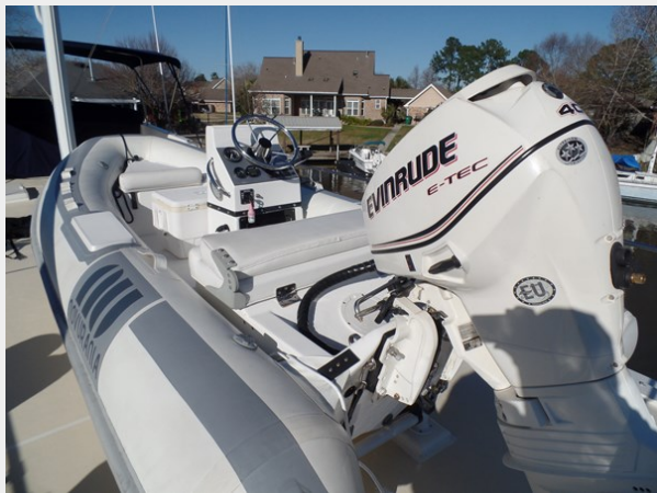
Mujuk Marine Trader 1984 Walkaround Tender (2)