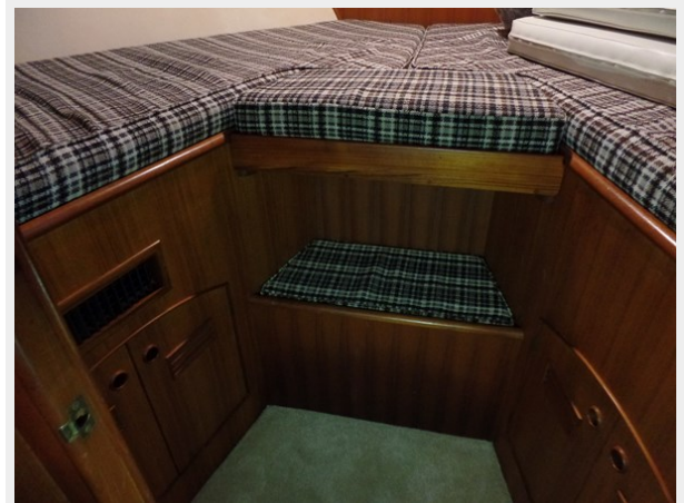
Mujuk Marine Trader 1984 Walkaround Fwd Stateroom (2)