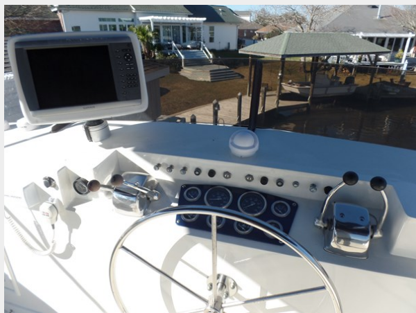
Mujuk Marine Trader 1984 Walkaround Upper Helm Station