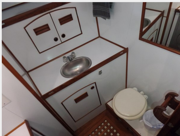
Mujuk Marine Trader 1984 Walkaround Forward Vanity