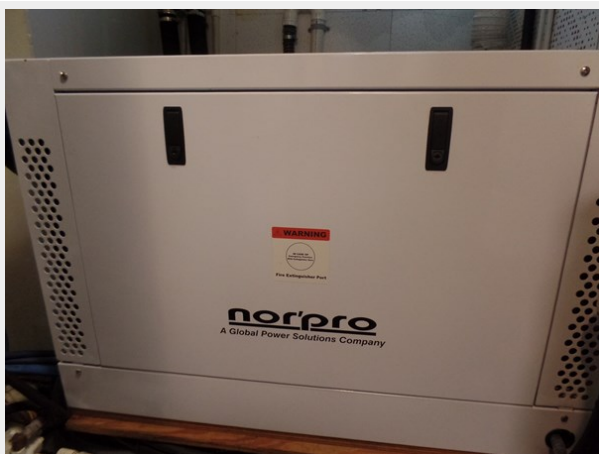
Mujuk Marine Trader 1984 Walkaround Genset