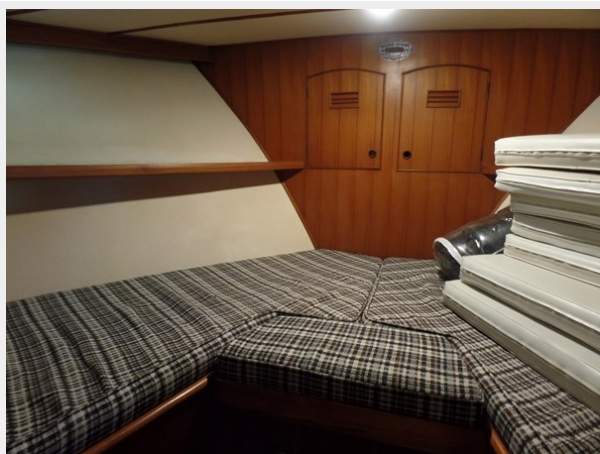
Mujuk Marine Trader 1984 Walkaround Fwd Stateroom