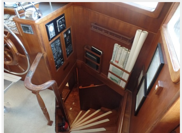
Mujuk Marine Trader 1984 Walkaround Ladder below Deck