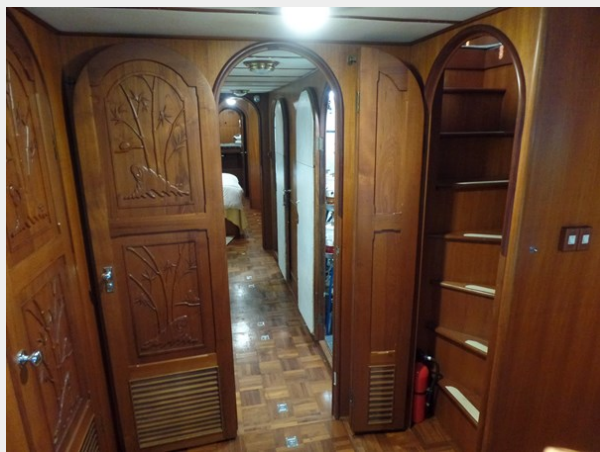
Mujuk Marine Trader 1984 Walkaround Passageway to VIP Stateroom