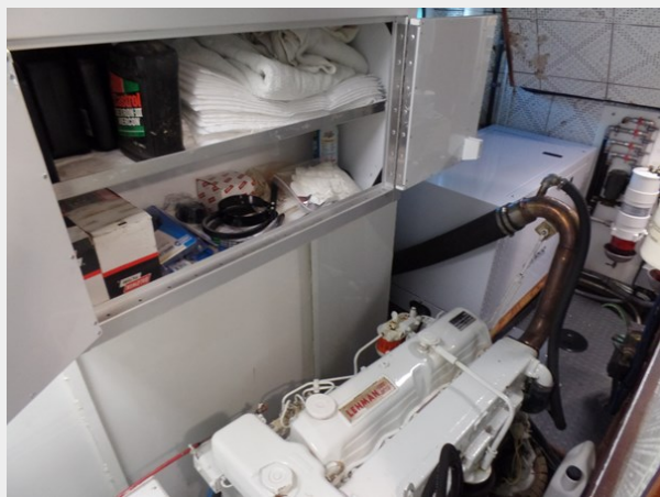
Mujuk Marine Trader 1984 Walkaround Stbd Engine Room