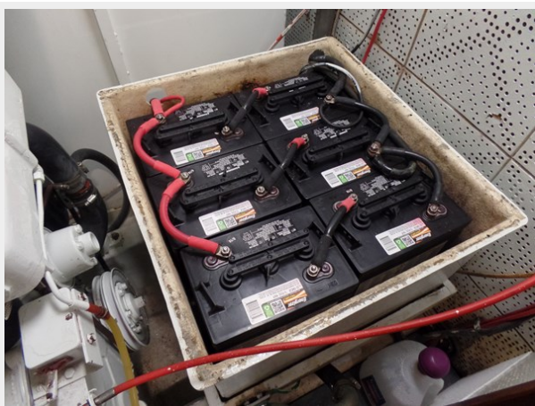
Mujuk Marine Trader 1984 Walkaround Batteries