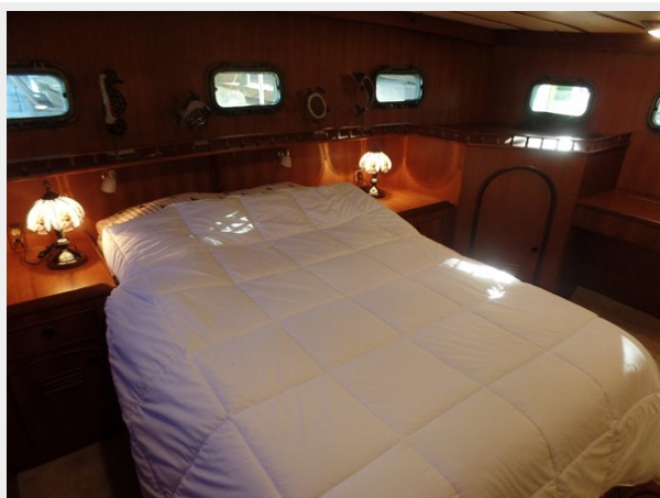
Mujuk Marine Trader 1984 Walkaround Master Stateroom (2)