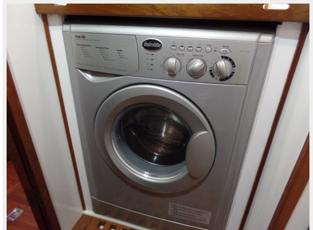
Mujuk Marine Trader 1984 Walkaround Washer and Dryer