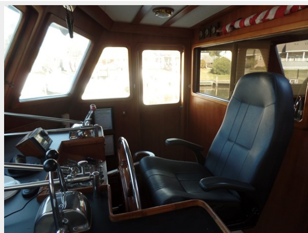
Mujuk Marine Trader 1984 Walkaround Helm Seat