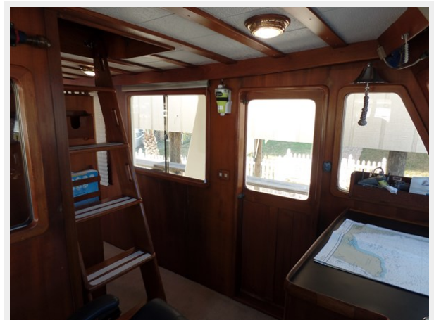
Mujuk Marine Trader 1984 Walkaround Ladder to Upper Deck