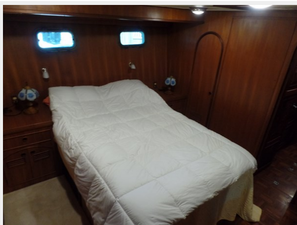
Mujuk Marine Trader 1984 Walkaround VIP Stateroom (2)