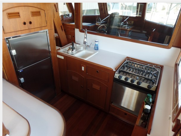
Mujuk Marine Trader 1984 Walkaround Galley (2)