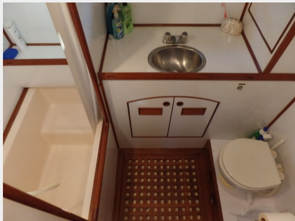
Mujuk Marine Trader 1984 Walkaround Master Head