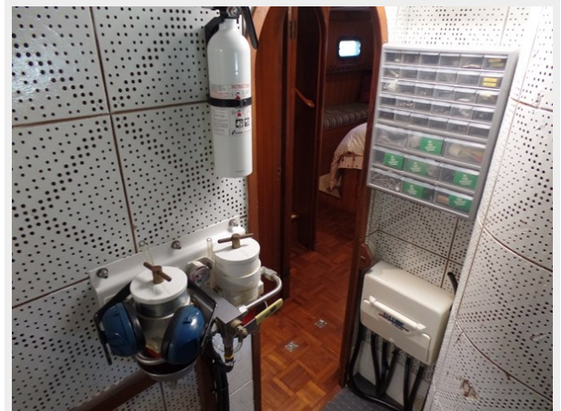
Mujuk Marine Trader 1984 Walkaround Port Engine Room