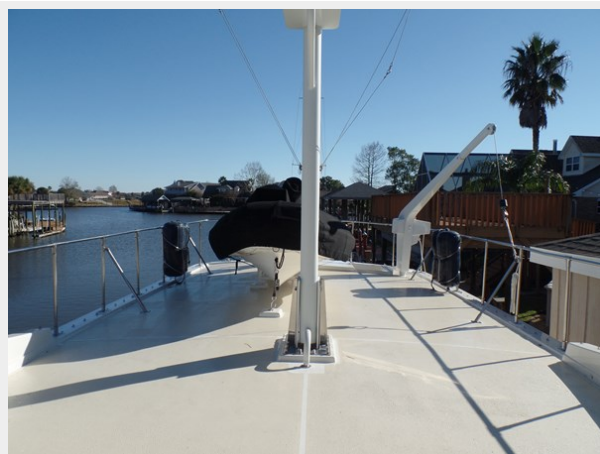
Mujuk Marine Trader 1984 Walkaround Upper Deck 2