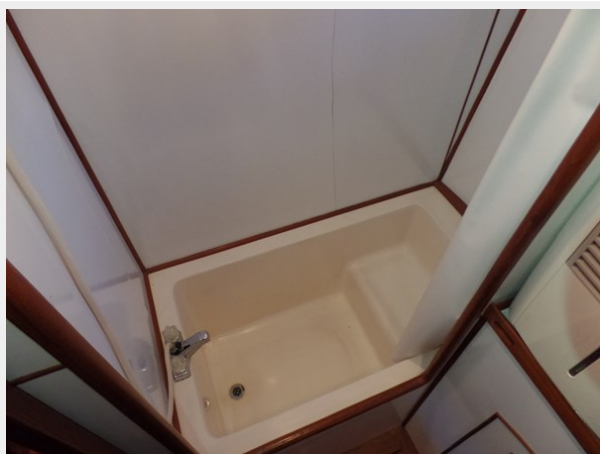
Mujuk Marine Trader 1984 Walkaround VIP Bath