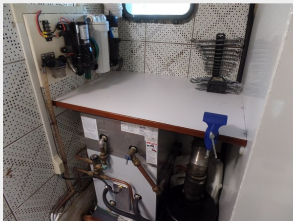
Mujuk Marine Trader 1984 Walkaround Port Engine Room Workbench