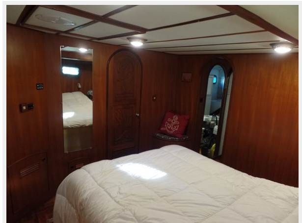
Mujuk Marine Trader 1984 Walkaround VIP Stateroom