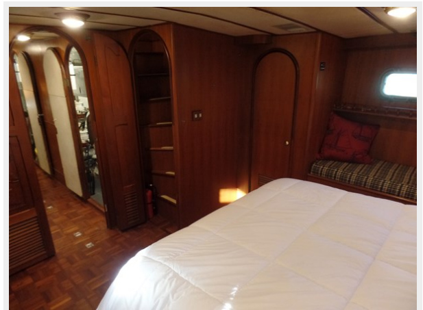
Mujuk Marine Trader 1984 Walkaround Master Stateroom (3)