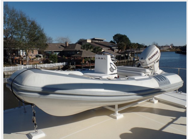
Mujuk Marine Trader 1984 Walkaround Tender