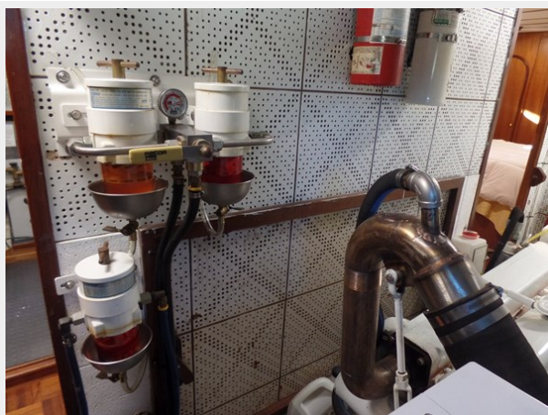
Mujuk Marine Trader 1984 Walkaround Stbd Engine Room (3)