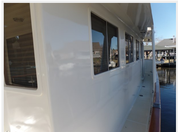
Mujuk Marine Trader 1984 Walkaround Stbd side of House