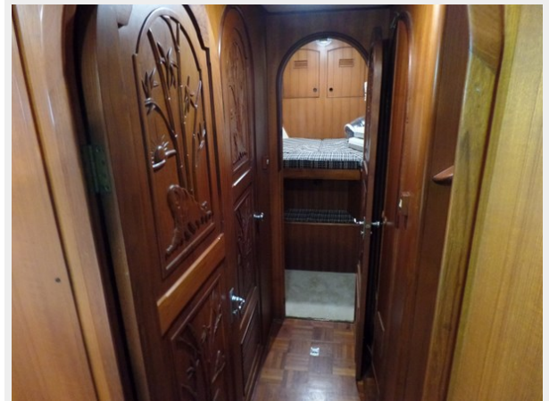
Mujuk Marine Trader 1984 Walkaround Passageway to Forward Stateroom