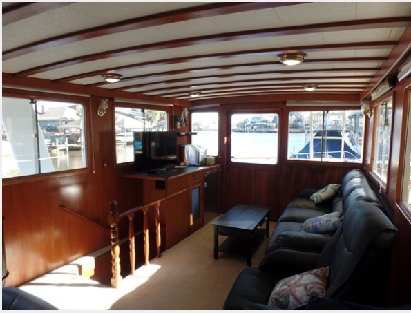
Mujuk Marine Trader 1984 Walkaround Salon (2)