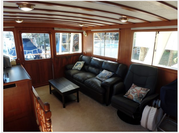
Mujuk Marine Trader 1984 Walkaround Salon