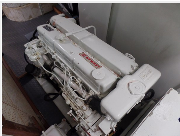
Mujuk Marine Trader 1984 Walkaround Port Engine