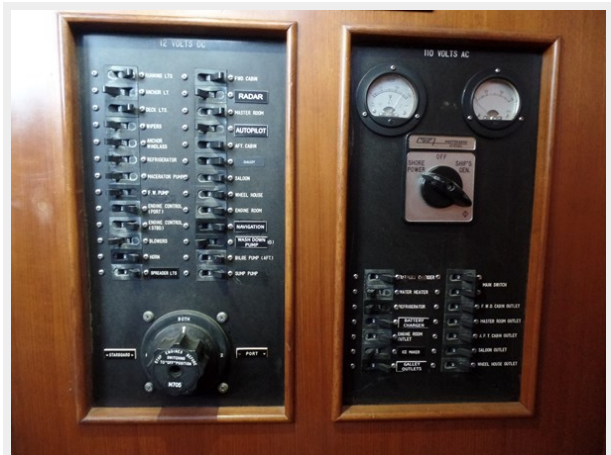
Mujuk Marine Trader 1984 Walkaround Distribution Panel