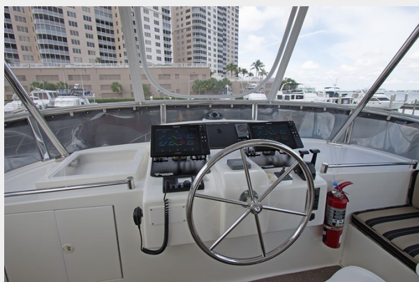
FB Helm Console