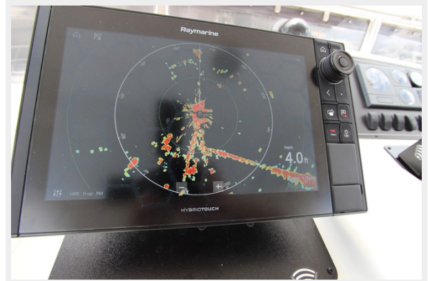
Flybridge New Axiom Port Display