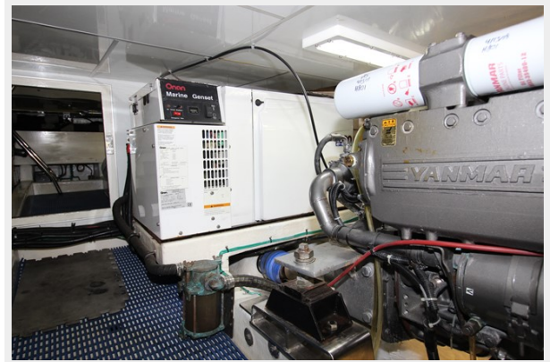
Onan 13.5 kW Generator