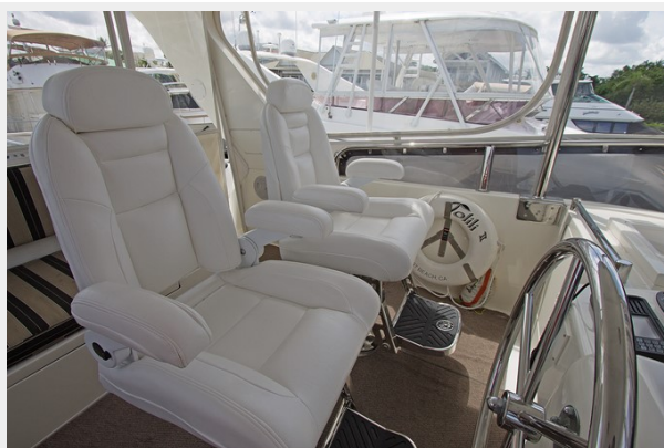
New FB Helm Seats