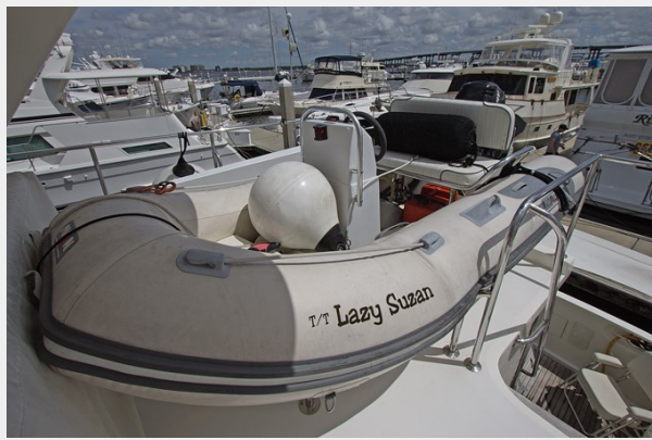
Tender on FB Boat Deck