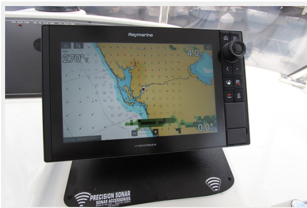
Flybridge New Axiom Starboard Display