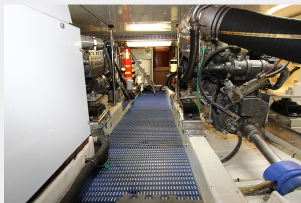
Engine Room Looking Forward