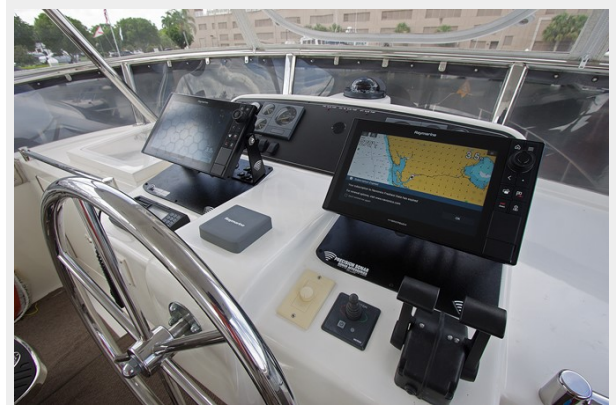
FB Helm Nav. Electronics