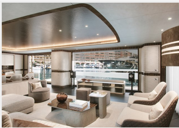
Dynamiq G350 int7