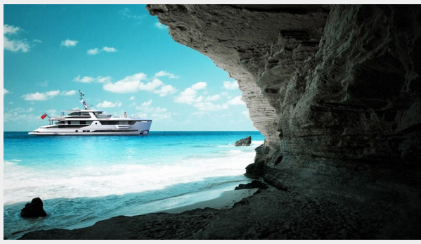
Dynamiq G350 005