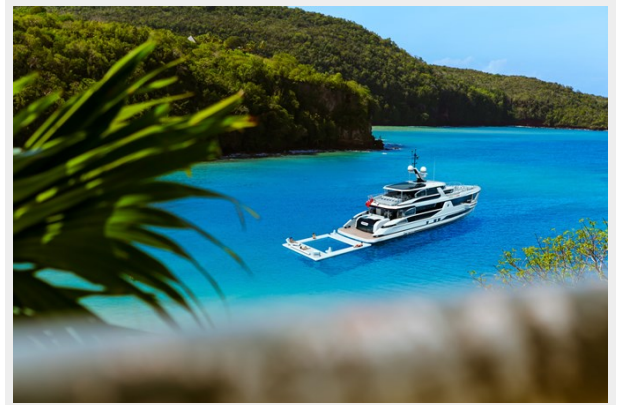
Dynamiq G350 006