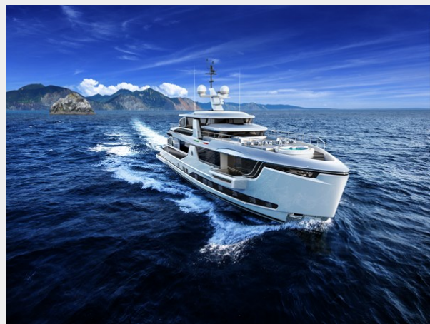
Dynamiq G350 001