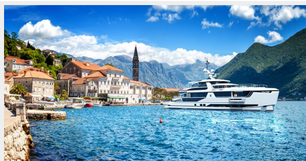
Dynamiq G350 003