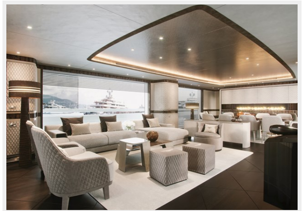
Dynamiq G350 int8