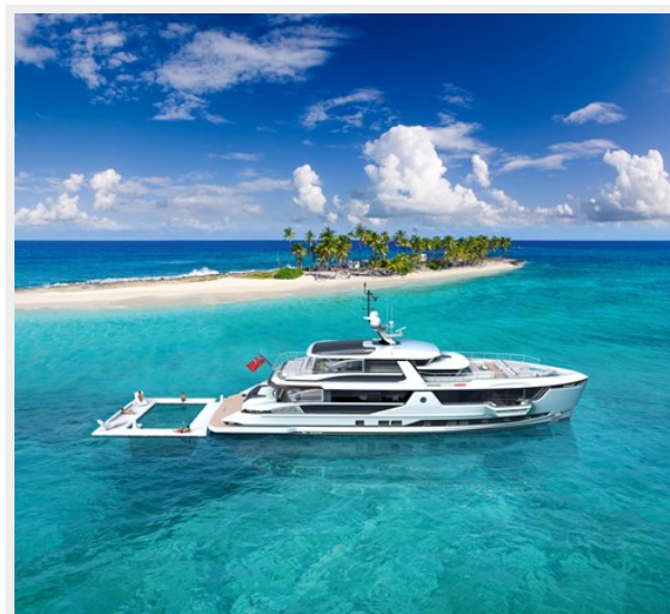
Dynamiq G350 002