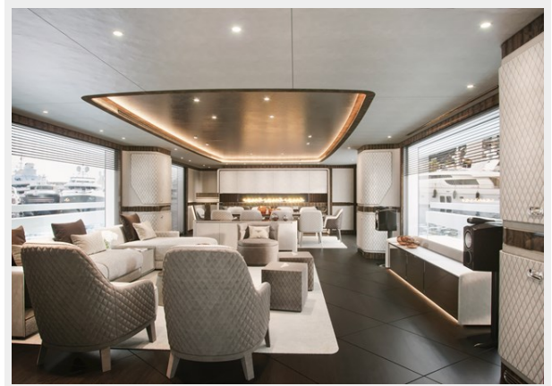
Dynamiq G350 int2