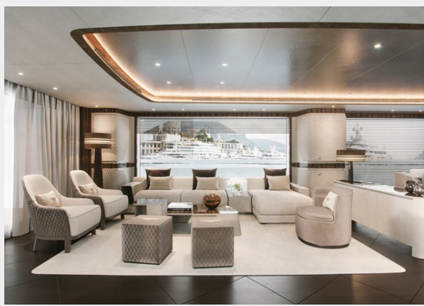
Dynamiq G350 int1