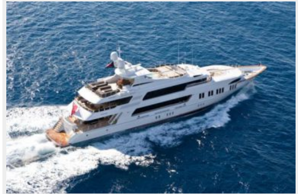
OCEAN CLUB 164' 2009 TRINITY TRI-DECK MOTOR YACHT