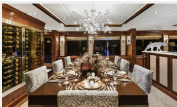
DINING: OCEAN CLUB 164' 2009 TRINITY TRI-DECK MOTOR YACHT