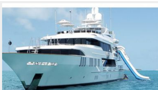
4m FREESTYLE SLIDE OCEAN CLUB 164' 2009 TRINITY TRI-DECK MOTOR YACHT