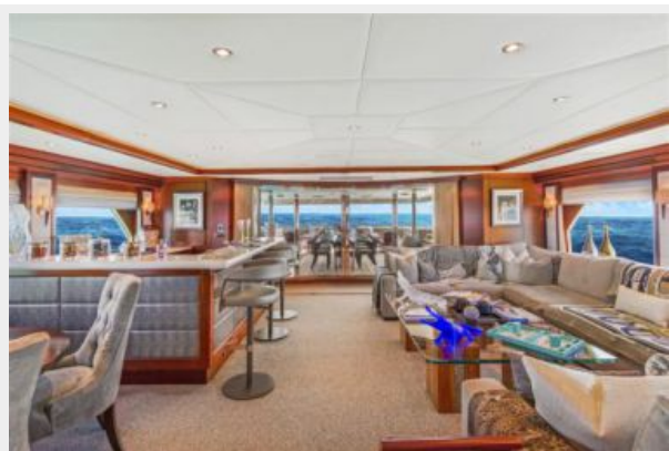
SKY LOUNGE: OCEAN CLUB 164' 2009 TRINITY TRI-DECK MOTOR YACHT