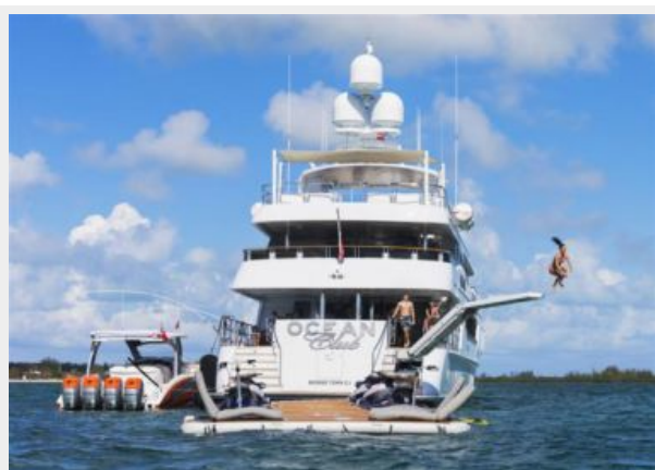
OCEAN CLUB 164' 2009 TRINITY TRI-DECK MOTOR YACHT