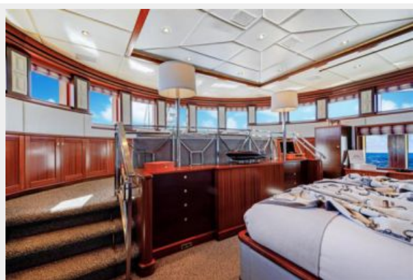
MASTER SUITE: OCEAN CLUB 164' 2009 TRINITY TRI-DECK MOTOR YACHT