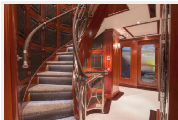
FOYER: OCEAN CLUB 164' 2009 TRINITY TRI-DECK MOTOR YACHT