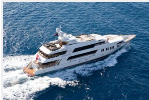
OCEAN CLUB 164' 2009 TRINITY TRI-DECK MOTOR YACHT