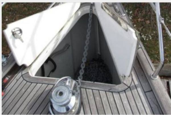
Windlass and anchor locker