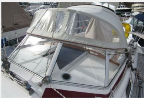
Rigid windscreen and dodger