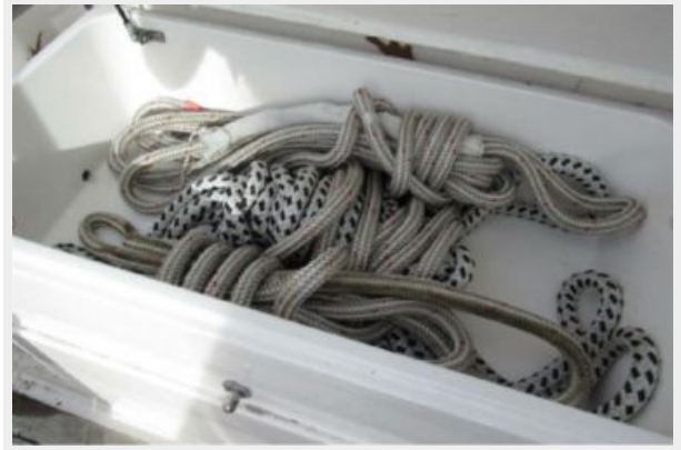
Cockpit rope storage