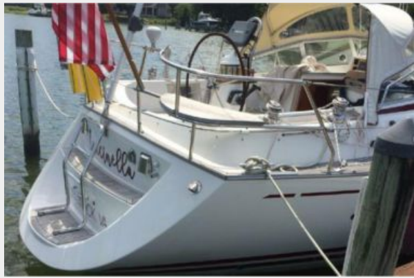
Transom from the dock