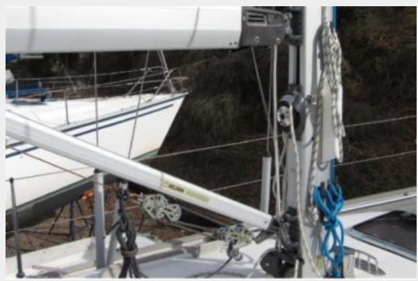
Mast and rigid vang