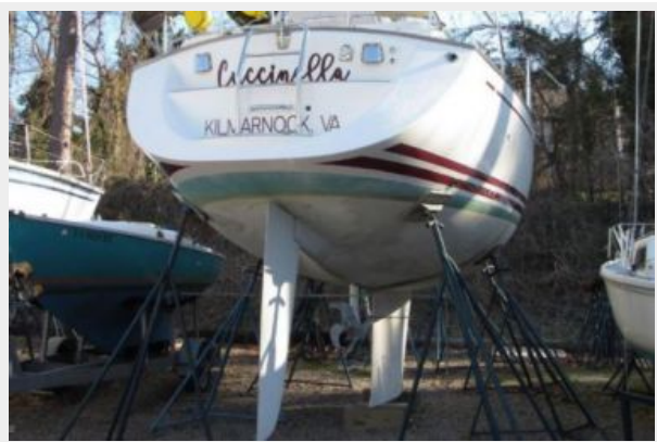
Cuccinella on the hard