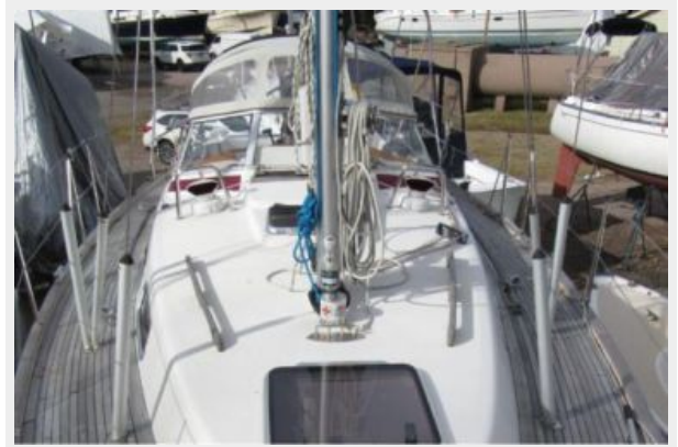
Deck looking aft