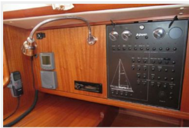
Electrical panel and electronics at nav station