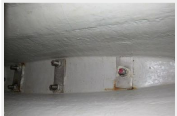
Bilge and keel bolts