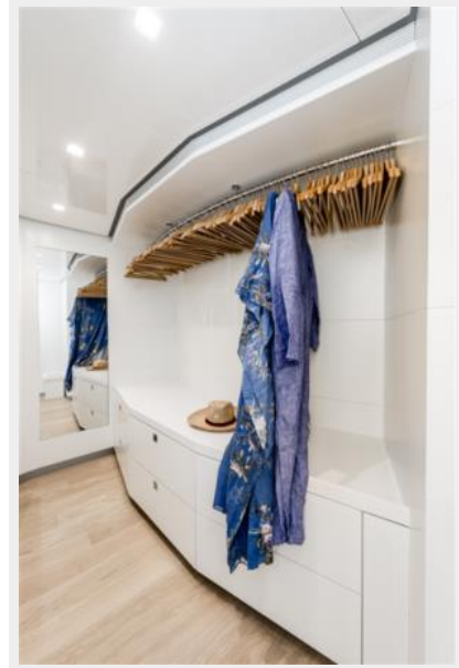
8 - Master walk-in Closet