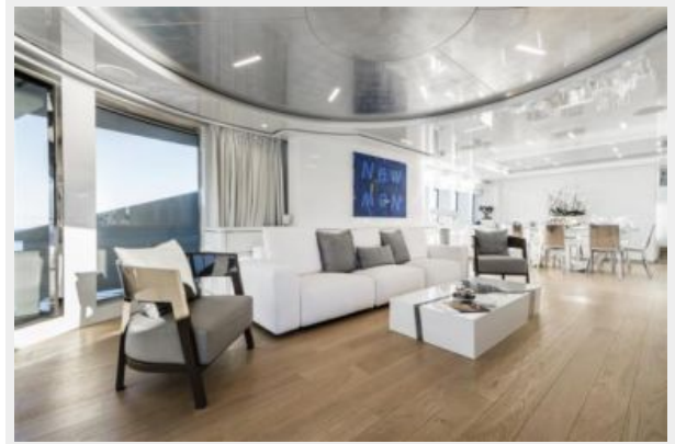
3 - Main Saloon 3