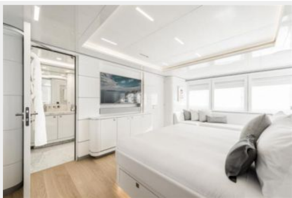
9 - Master