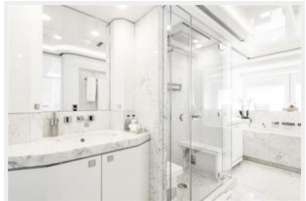
10 - Master Bath 1 - bath-shower-sink