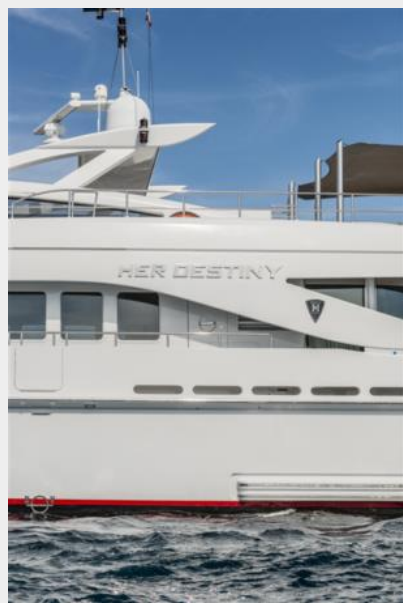
33 - Detail - HER DESTINY