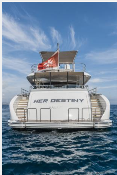
31 - Aft - No Toys