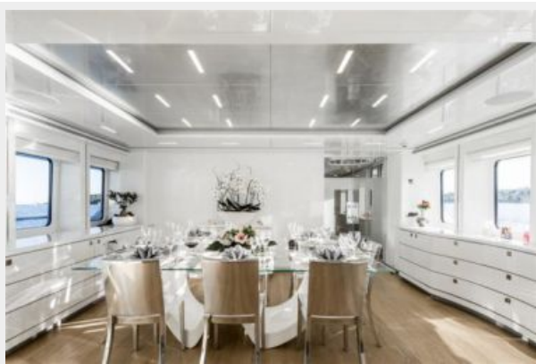
4 - Dining 1