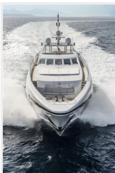
29 -Running - Bow