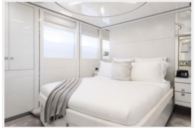
14 - Double 2