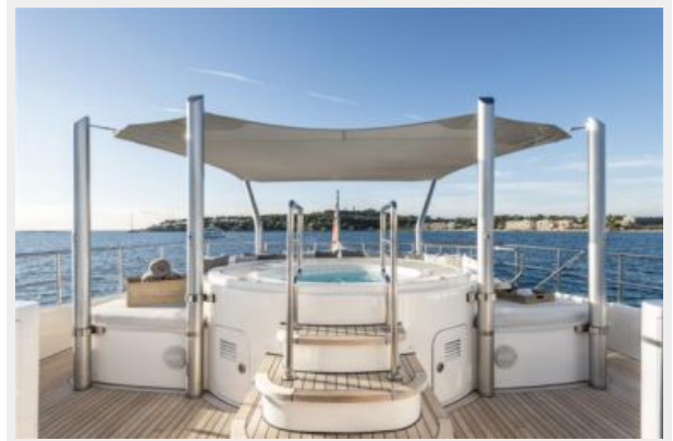
22 - Jacuzzi 1