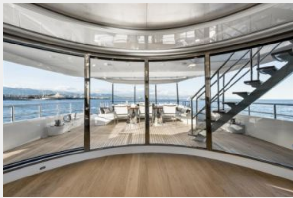
25 - Main Saloon to Outdoor