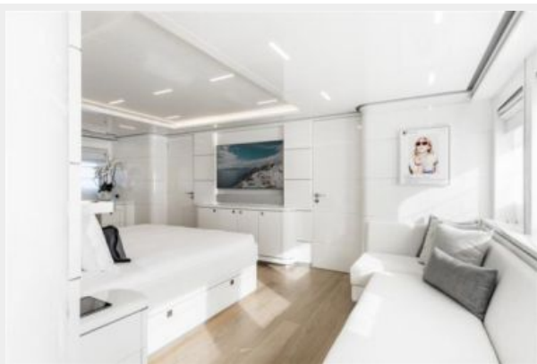
6 - Master