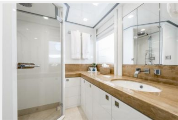
17 - Bathroom - Kids