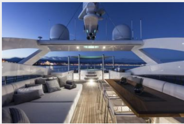
21 - Flydeck night