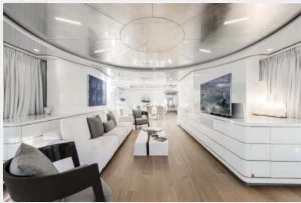
2 - Main Saloon 2