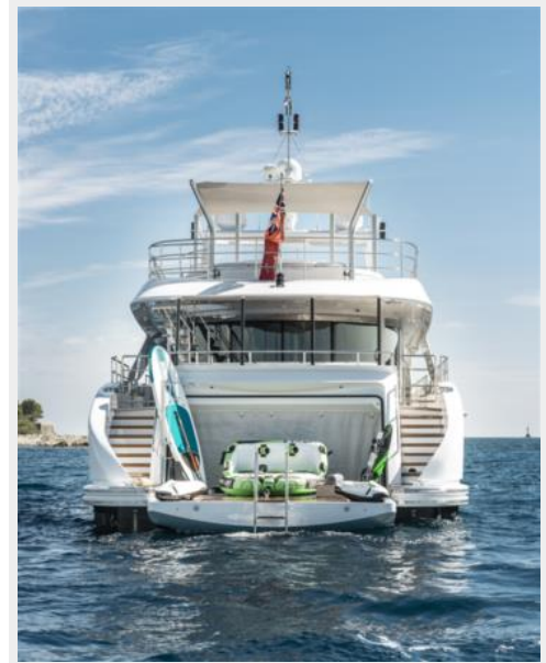
32 - Aft with toys and Swim platform