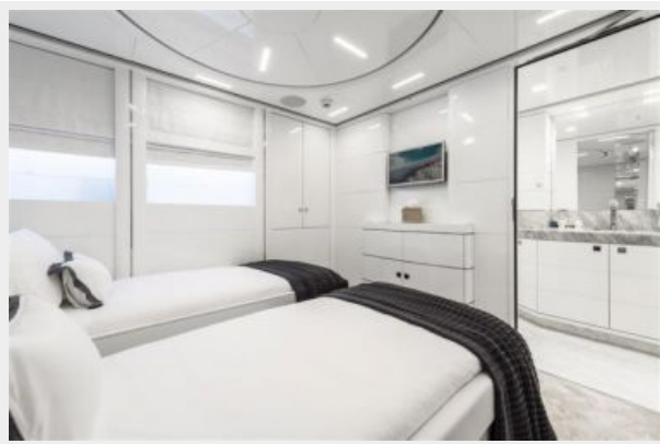
15 - Twin Cabin