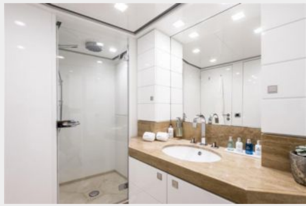
13 - Double 1 bathroom