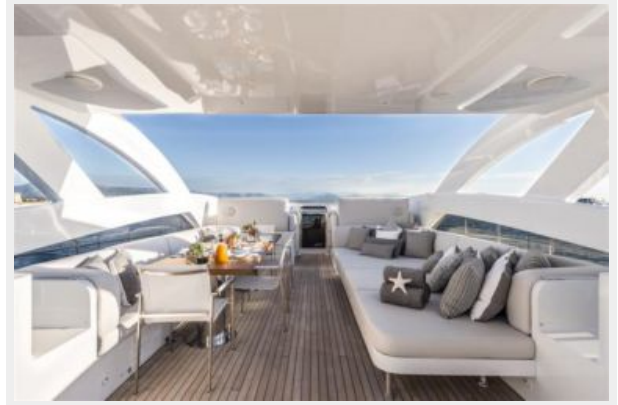
20 - Flybridge 1