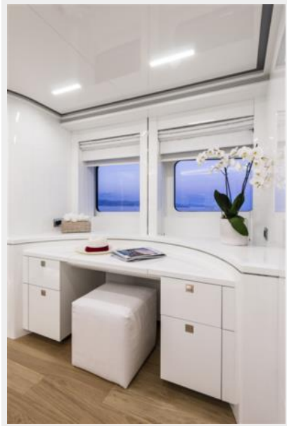
8 - Master - Desk Detail