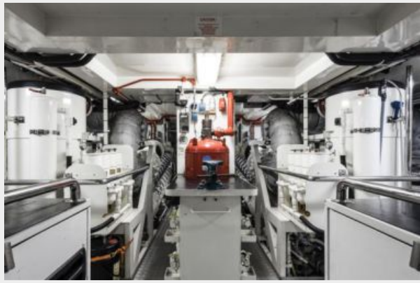
19 - Engine Room