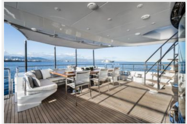
26 - Main Deck Outdoor Dining