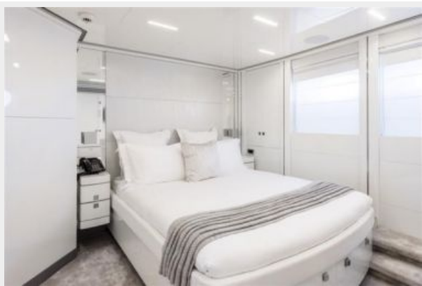
11 - Double 1