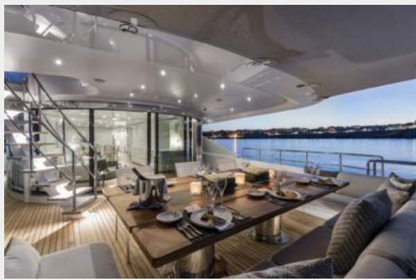
27 - Main Deck Outside - Night Dressed