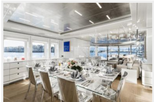
5 - Dining 3