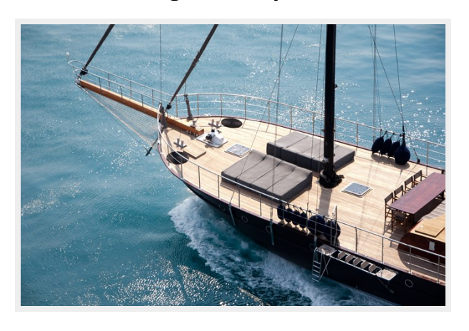
a great sunpad