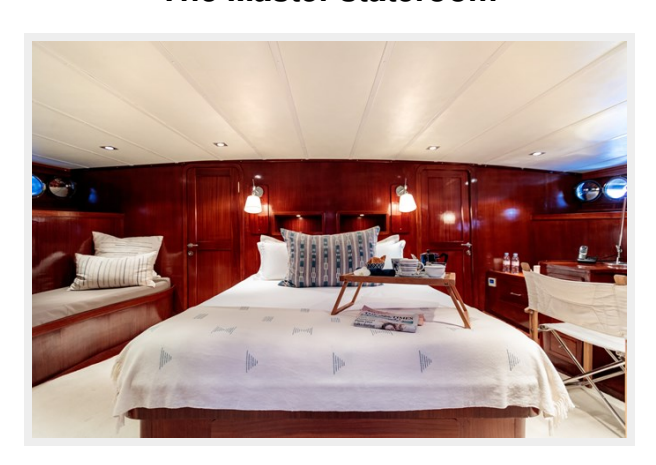
The Master stateroom