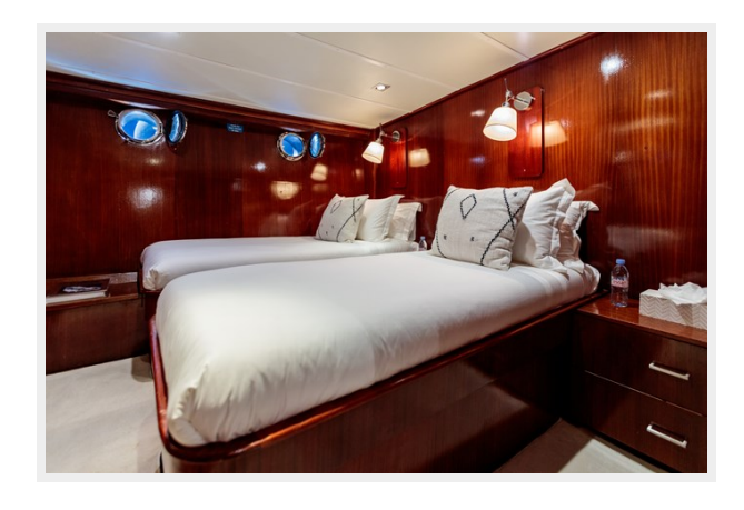
First twin stateroom with ensuite head