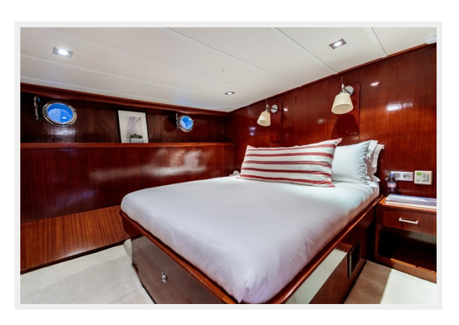
Second VIP stateroom