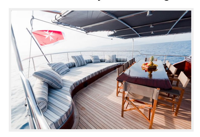
offering another dining spot for up to 12 guests