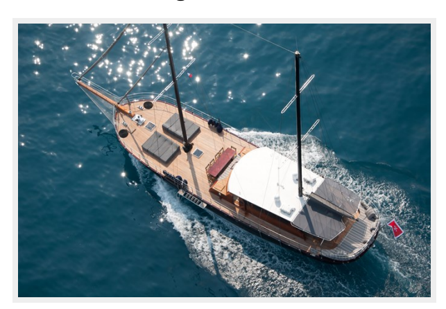
offering a 140 m² deck