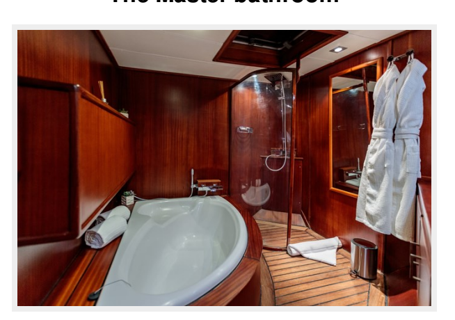
The Master bathroom