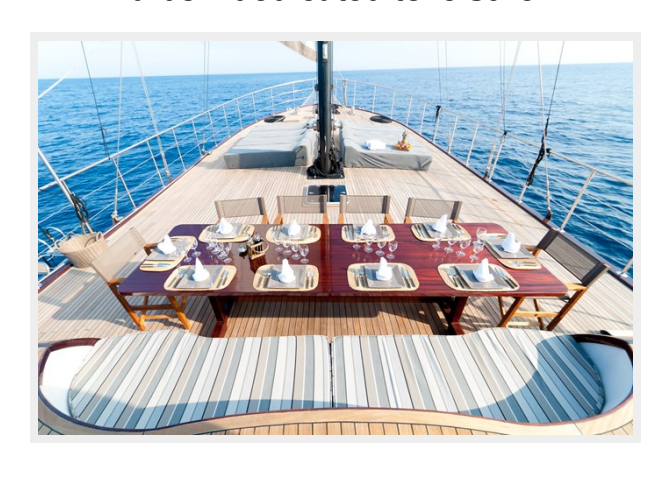
a bow dedicated to leisure