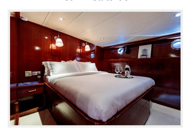
First VIP stateroom