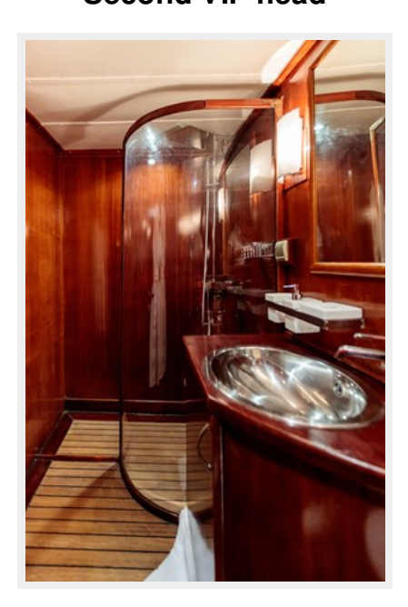
Second VIP head