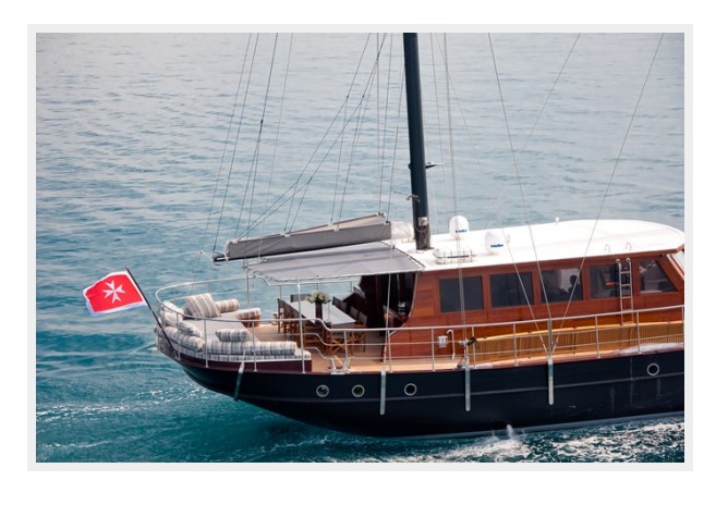
a very welcoming aft