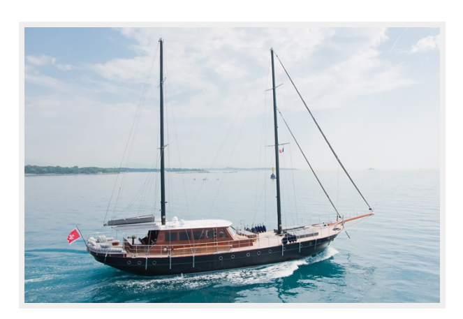
32 meters Turkish Gulet