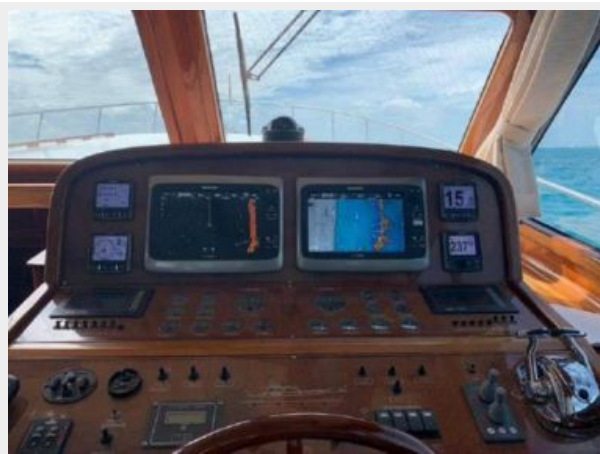
Helm underway, note how view is excellent