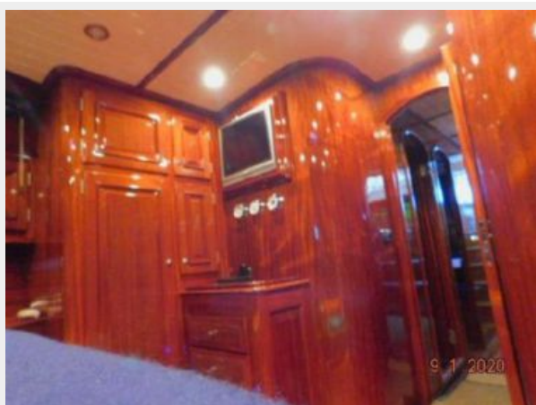
Master stateroom closets and tv