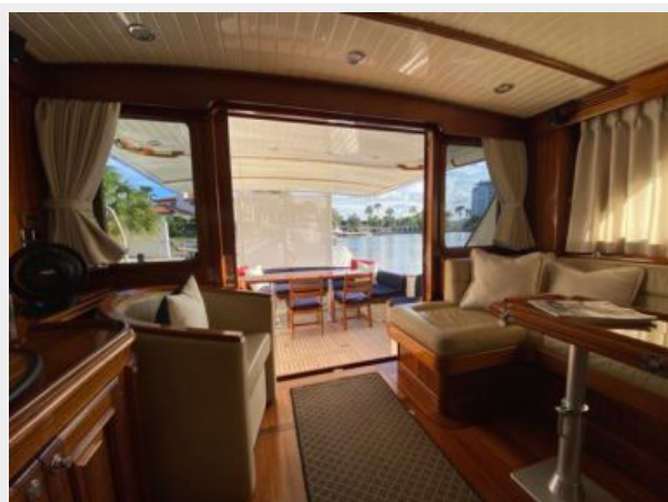
Blue Lobster salon view aft