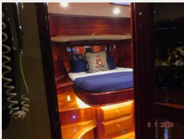
Master stateroom from the head