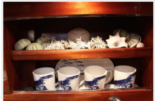
Blue Lobster decor