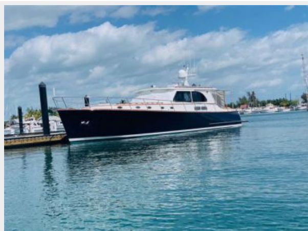
Blue Lobster port profile