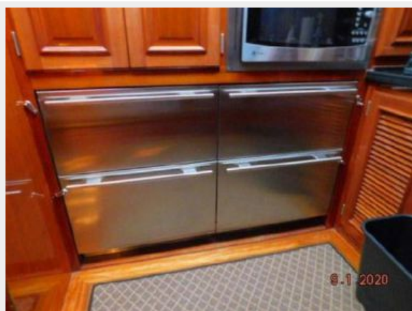
Four Sub Zero Drawer units, 2 are freezers