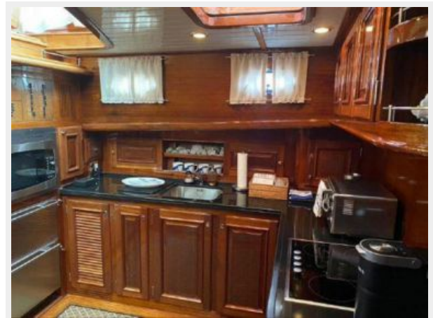
Large and spacious galley