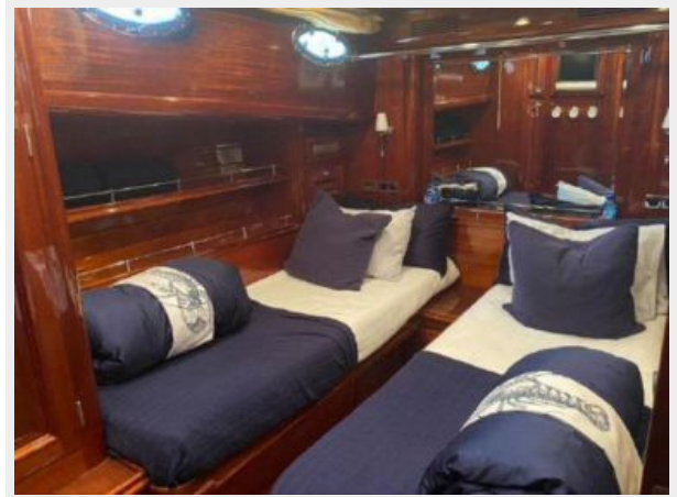
Guest stateroom, has its own head, berths can be merged creating large double