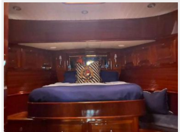
Master stateroom centerline queen