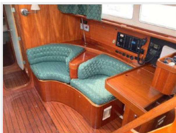
Comfy chairs with storage below