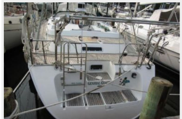
Stern view showing davits