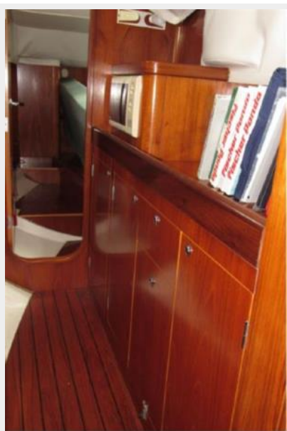
Galley storage inboard