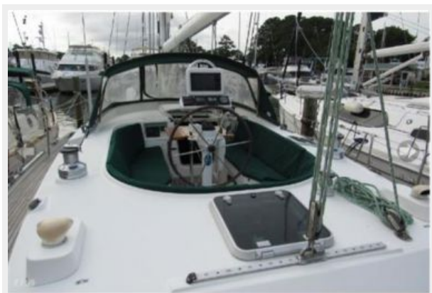
Traveler and cockpit