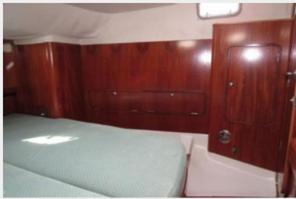
Port storage, aft cabin