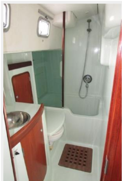
Aft head with separate shower/tub