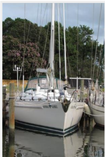
In the slip