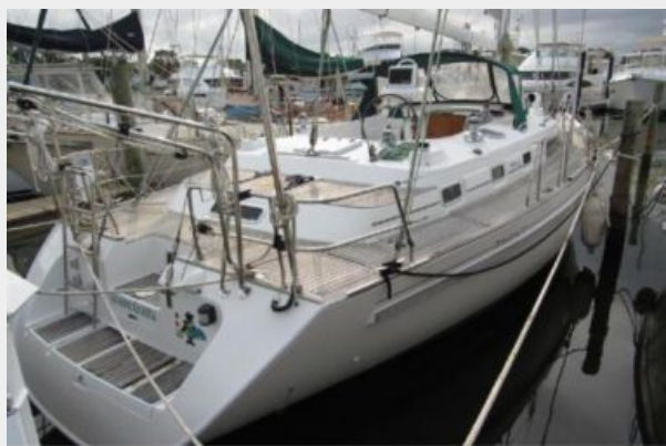
Transom and aft deck