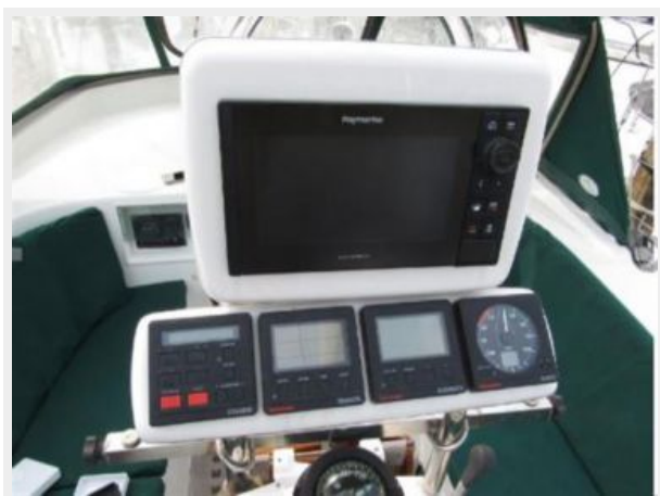
Instruments at helm