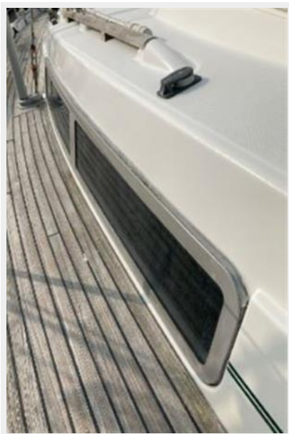
Side deck and windows