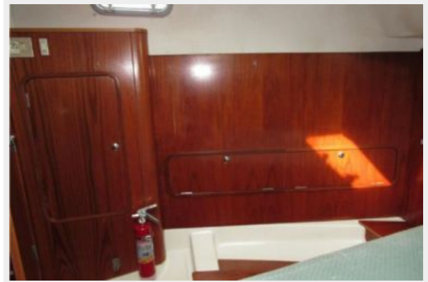
Starboard storage, aft cabin