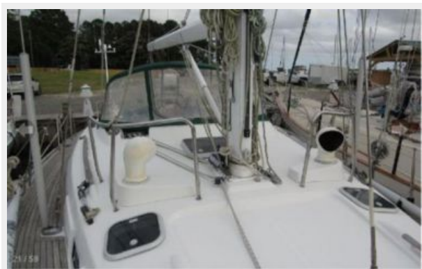
Mast base and dorades