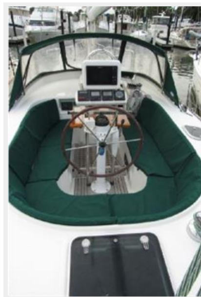
Wheel and instruments, dodger