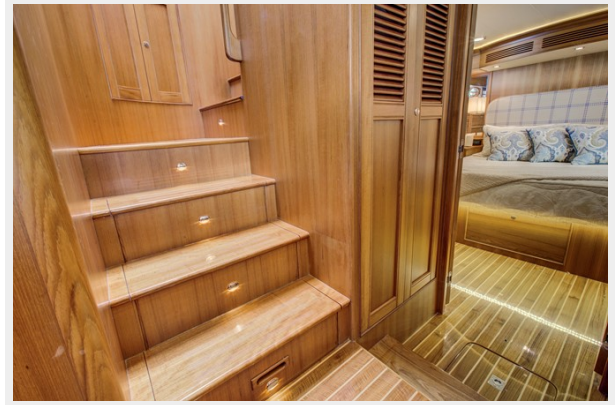
Pilothouse to Companionway Steps 2