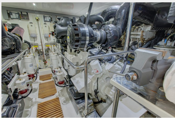
Engine Room Looking Starboard