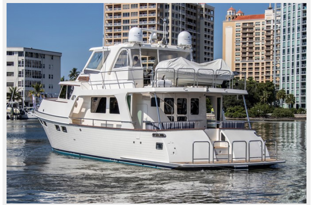
Swim Platform w/ Ladder & Removable N-rails