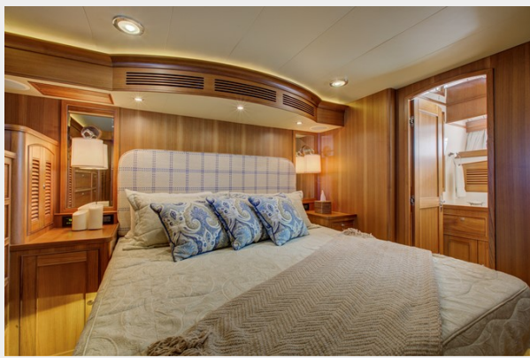
Master Stateroom Looking Aft