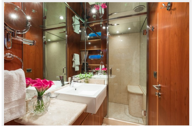
Lower Deck Guest Head