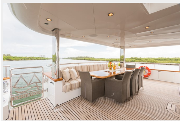
Aft Deck Dining Area