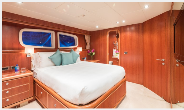
Lower Deck Guest Stateroom