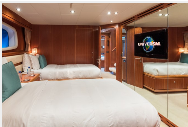
Lower Deck Guest Stateroom