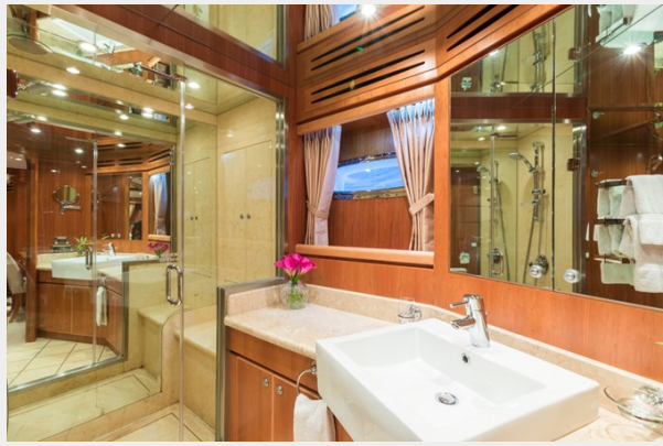
Lower Deck VIP Head