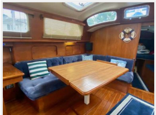
Irwin 46 Center Cockpit Ketch - Rythm - 40