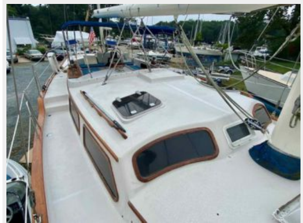
Irwin 46 Center Cockpit Ketch - Rythm - 28