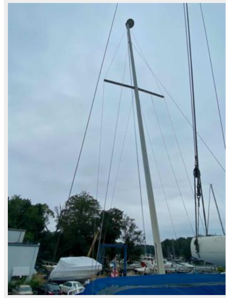
Irwin 46 Center Cockpit Ketch - Rythm - 74