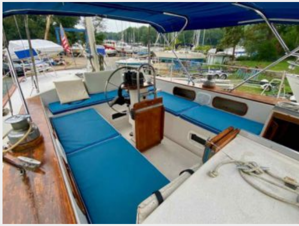
Irwin 46 Center Cockpit Ketch - Rythm - 13