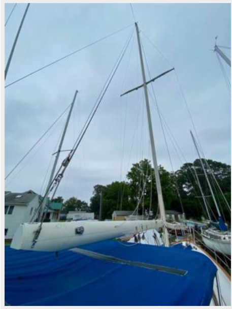
Irwin 46 Center Cockpit Ketch - Rythm - 73