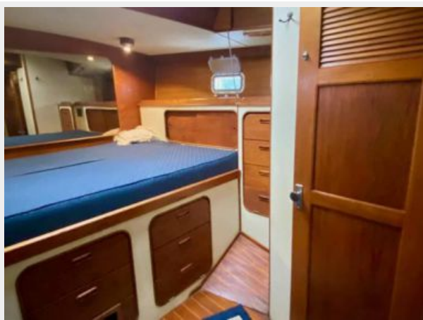
Irwin 46 Center Cockpit Ketch - Rythm - 63