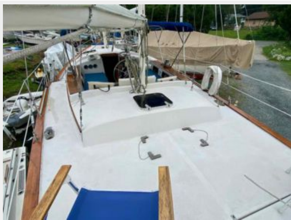
Irwin 46 Center Cockpit Ketch - Rythm - 9