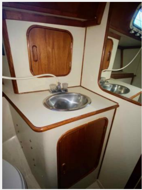
Irwin 46 Center Cockpit Ketch - Rythm - 49