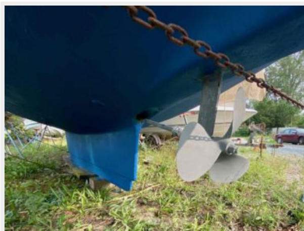
Irwin 46 Center Cockpit Ketch - Rythm - 88