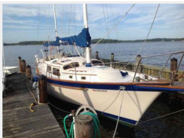
Irwin 46 Center Cockpit Ketch - Rythm - 1