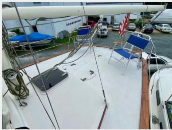
Irwin 46 Center Cockpit Ketch - Rythm - 7