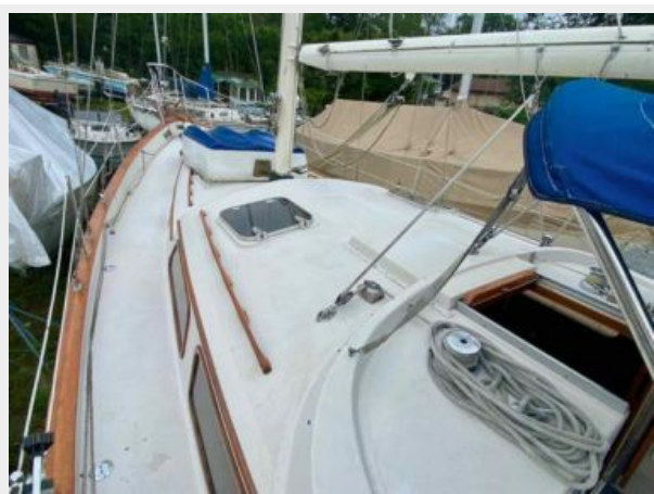
Irwin 46 Center Cockpit Ketch - Rythm - 21