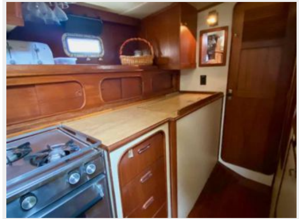
Irwin 46 Center Cockpit Ketch - Rythm - 56