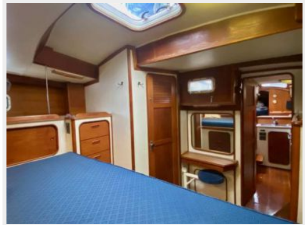
Irwin 46 Center Cockpit Ketch - Rythm - 64