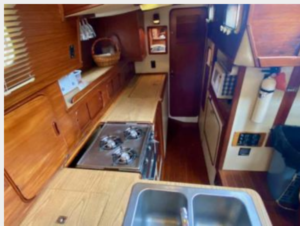
Irwin 46 Center Cockpit Ketch - Rythm - 51