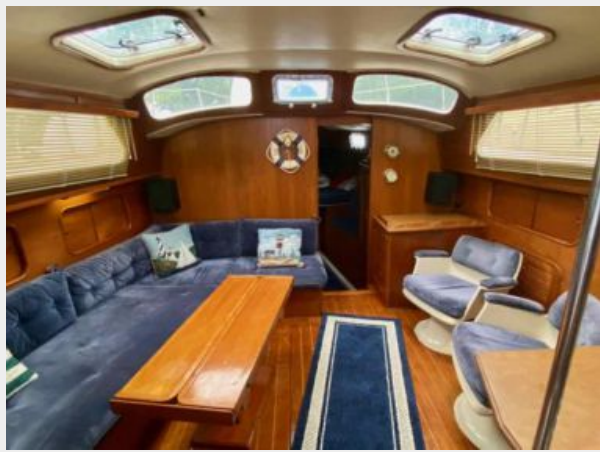
Irwin 46 Center Cockpit Ketch - Rythm - 31