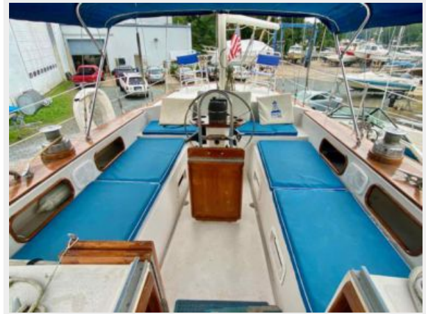
Irwin 46 Center Cockpit Ketch - Rythm - 14