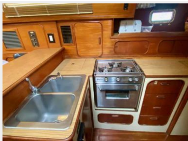
Irwin 46 Center Cockpit Ketch - Rythm - 53