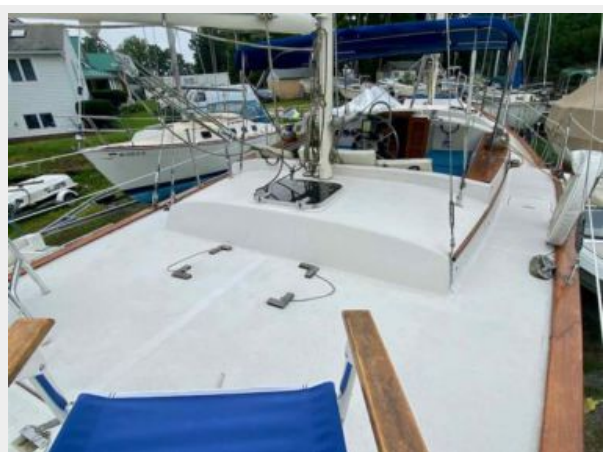
Irwin 46 Center Cockpit Ketch - Rythm - 3