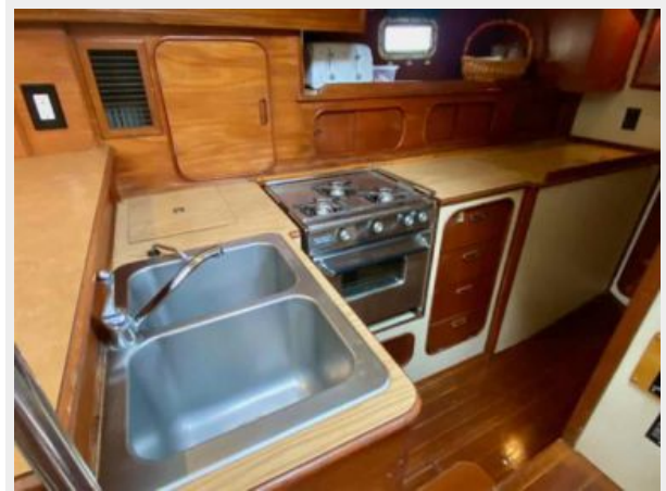
Irwin 46 Center Cockpit Ketch - Rythm - 52