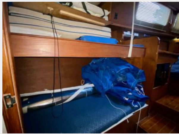
Irwin 46 Center Cockpit Ketch - Rythm - 69