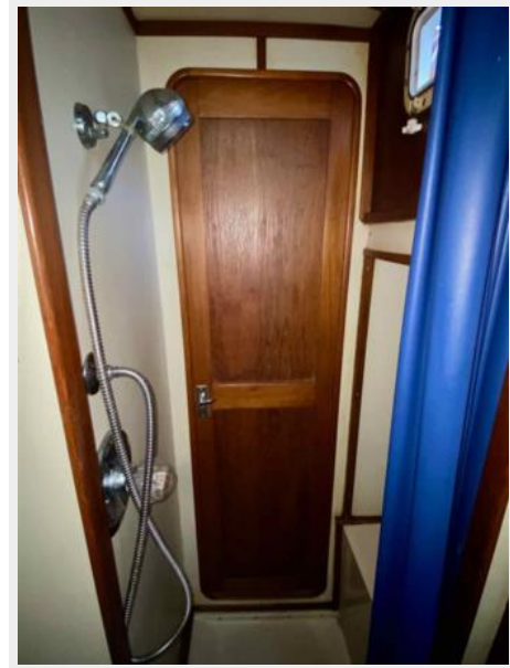
Irwin 46 Center Cockpit Ketch - Rythm - 66