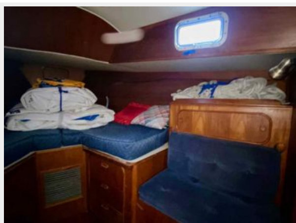
Irwin 46 Center Cockpit Ketch - Rythm - 47