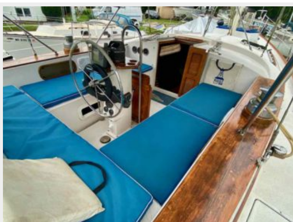
Irwin 46 Center Cockpit Ketch - Rythm - 11