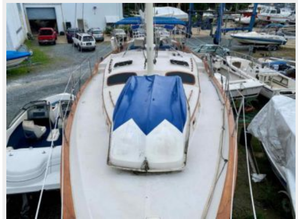
Irwin 46 Center Cockpit Ketch - Rythm - 26