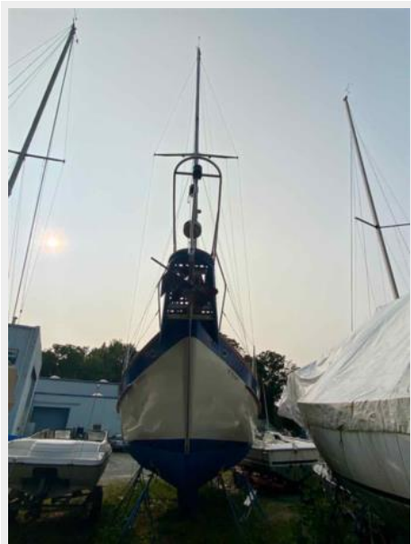
Irwin 46 Center Cockpit Ketch - Rythm - 71