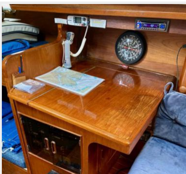
Irwin 46 Center Cockpit Ketch - Rythm - 35