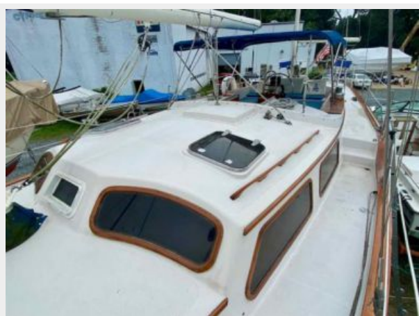
Irwin 46 Center Cockpit Ketch - Rythm - 23