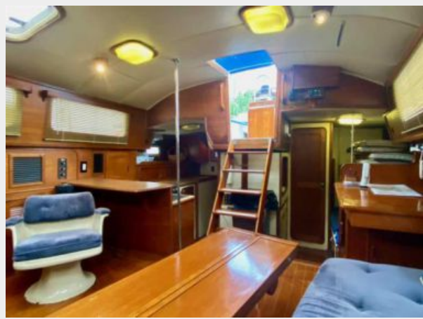
Irwin 46 Center Cockpit Ketch - Rythm - 37