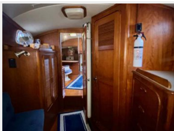
Irwin 46 Center Cockpit Ketch - Rythm - 45