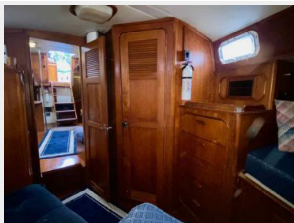
Irwin 46 Center Cockpit Ketch - Rythm - 44