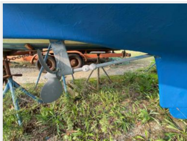
Irwin 46 Center Cockpit Ketch - Rythm - 92