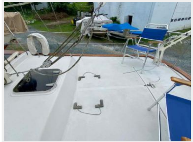
Irwin 46 Center Cockpit Ketch - Rythm - 8