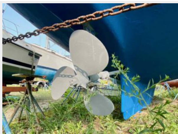
Irwin 46 Center Cockpit Ketch - Rythm - 89