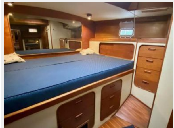
Irwin 46 Center Cockpit Ketch - Rythm - 58