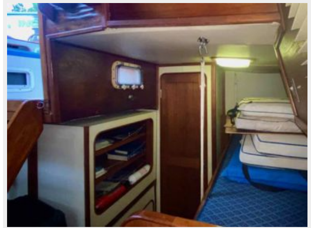
Irwin 46 Center Cockpit Ketch - Rythm - 70