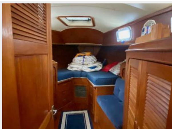
Irwin 46 Center Cockpit Ketch - Rythm - 41