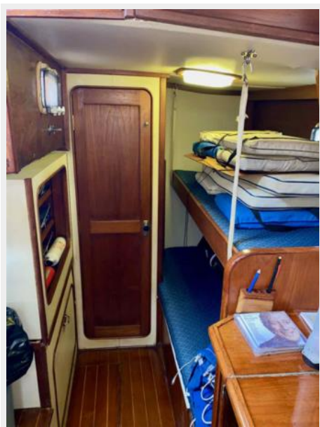
Irwin 46 Center Cockpit Ketch - Rythm - 67