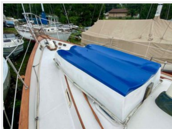
Irwin 46 Center Cockpit Ketch - Rythm - 22