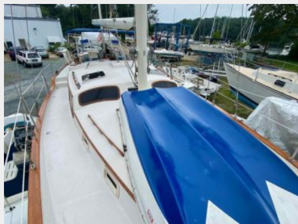
Irwin 46 Center Cockpit Ketch - Rythm - 27