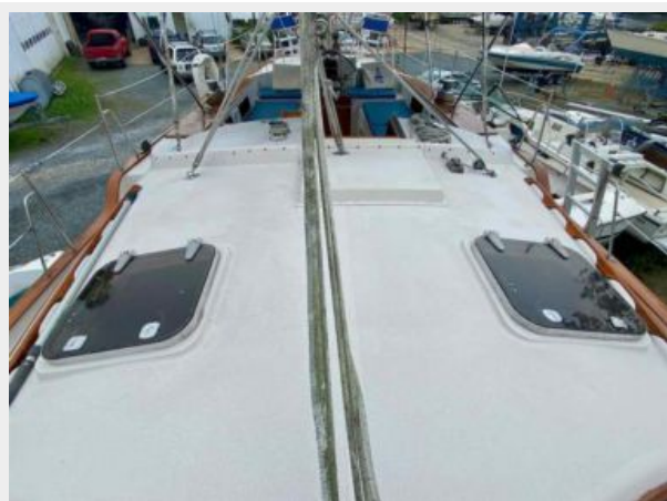
Irwin 46 Center Cockpit Ketch - Rythm - 29