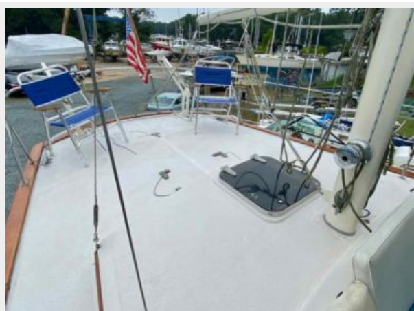
Irwin 46 Center Cockpit Ketch - Rythm - 5