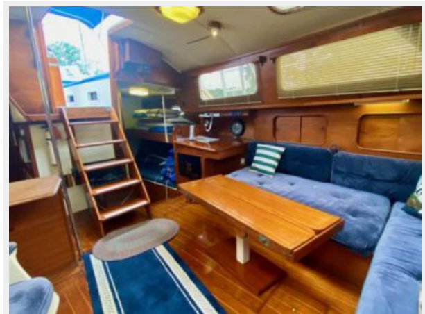
Irwin 46 Center Cockpit Ketch - Rythm - 34