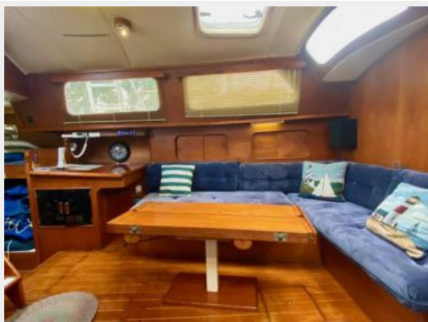
Irwin 46 Center Cockpit Ketch - Rythm - 33