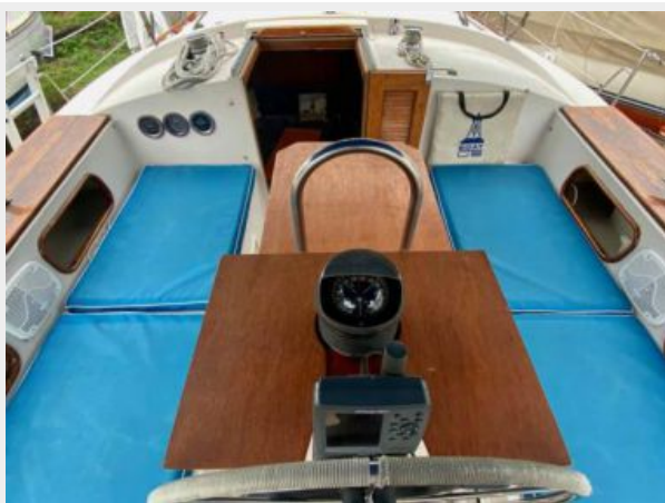
Irwin 46 Center Cockpit Ketch - Rythm - 17