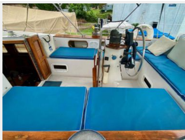
Irwin 46 Center Cockpit Ketch - Rythm - 19