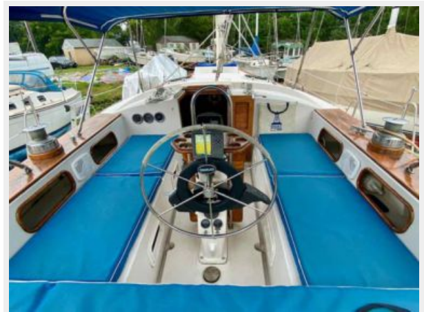
Irwin 46 Center Cockpit Ketch - Rythm - 10