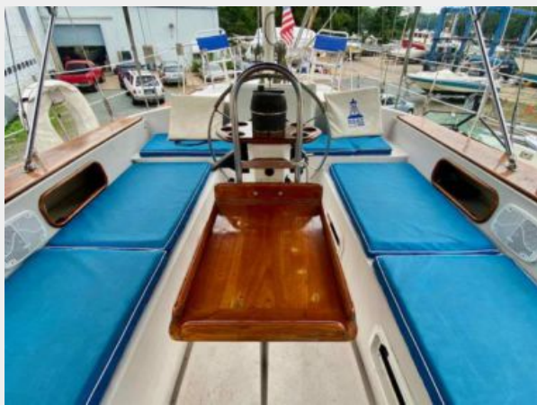
Irwin 46 Center Cockpit Ketch - Rythm - 15