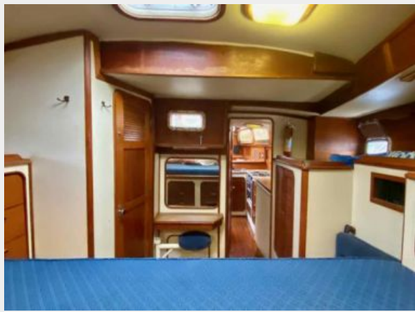
Irwin 46 Center Cockpit Ketch - Rythm - 61