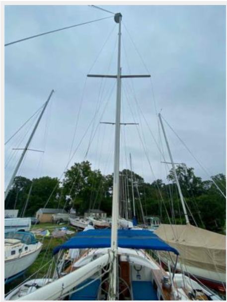
Irwin 46 Center Cockpit Ketch - Rythm - 75