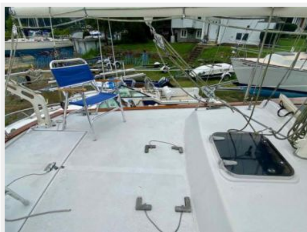
Irwin 46 Center Cockpit Ketch - Rythm - 4