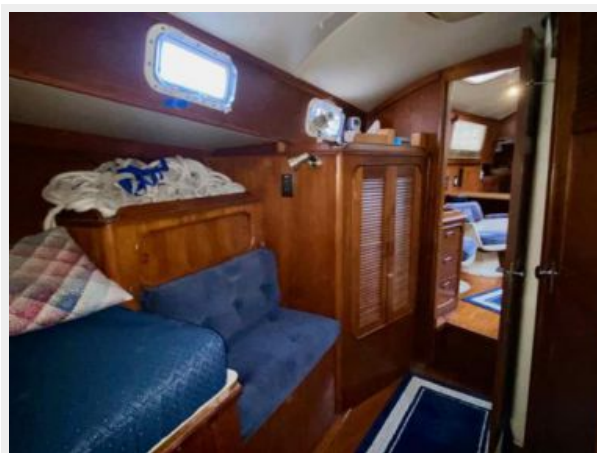
Irwin 46 Center Cockpit Ketch - Rythm - 46