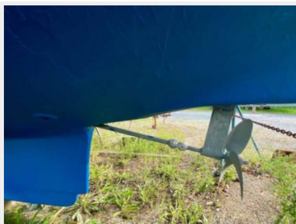
Irwin 46 Center Cockpit Ketch - Rythm - 87