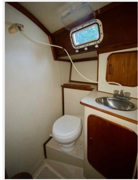
Irwin 46 Center Cockpit Ketch - Rythm - 50