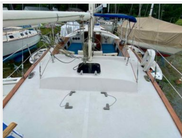
Irwin 46 Center Cockpit Ketch - Rythm - 2