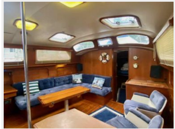
Irwin 46 Center Cockpit Ketch - Rythm - 32