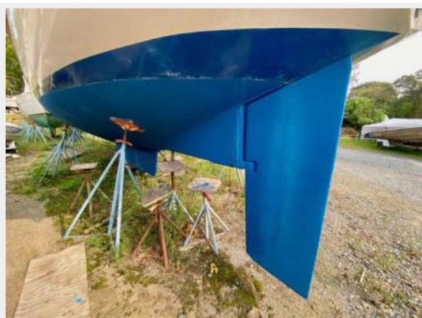
Irwin 46 Center Cockpit Ketch - Rythm - 91