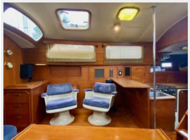
Irwin 46 Center Cockpit Ketch - Rythm - 38