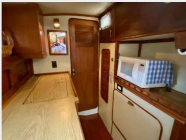
Irwin 46 Center Cockpit Ketch - Rythm - 57