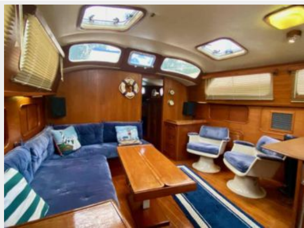
Irwin 46 Center Cockpit Ketch - Rythm - 39