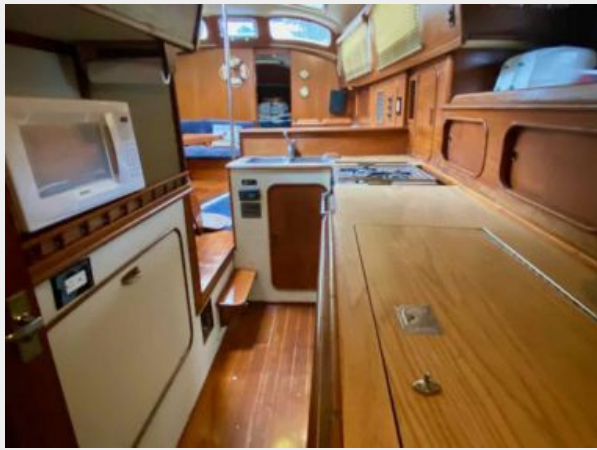
Irwin 46 Center Cockpit Ketch - Rythm - 55