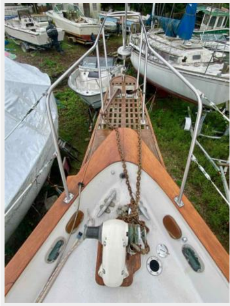
Irwin 46 Center Cockpit Ketch - Rythm - 25