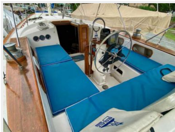
Irwin 46 Center Cockpit Ketch - Rythm - 20