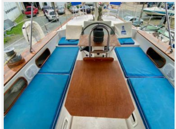
Irwin 46 Center Cockpit Ketch - Rythm - 16