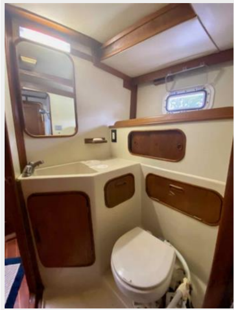
Irwin 46 Center Cockpit Ketch - Rythm - 65