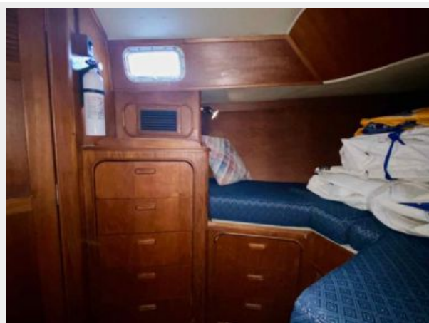
Irwin 46 Center Cockpit Ketch - Rythm - 43