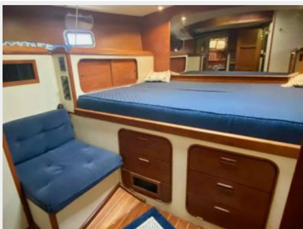
Irwin 46 Center Cockpit Ketch - Rythm - 59