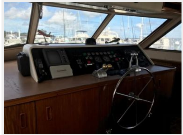
Lower helm 1