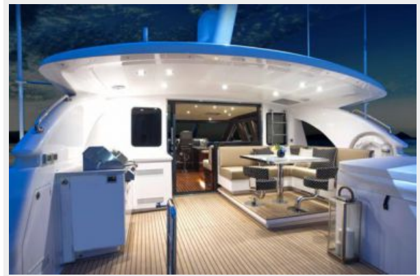
Flybridge Aft Deck