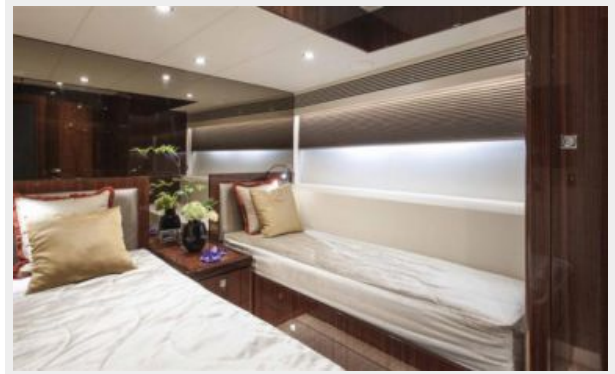
Guest Stateroom Twins