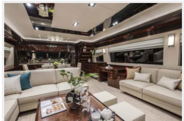
Main Salon Port