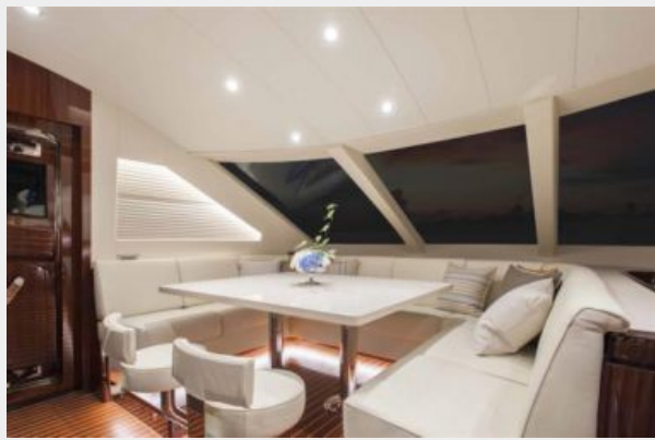
Dinette Forward Galley