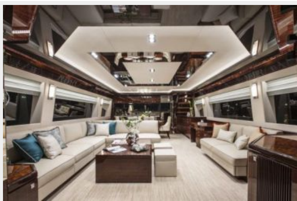
Main Salon Forward