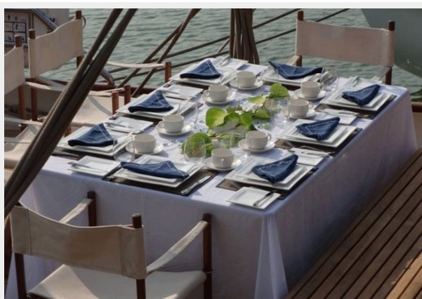
Dining on deck