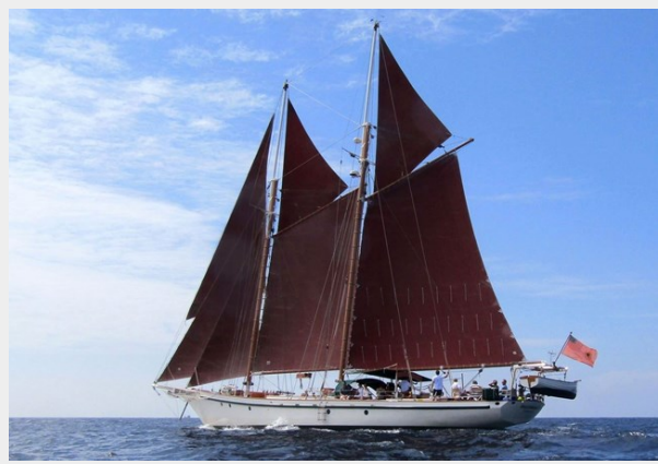
Portside full sail