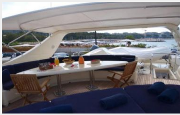
amorina june 2011 007