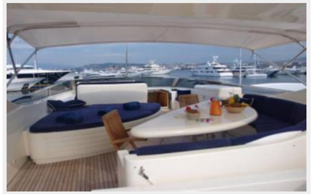
amorina june 2011 008