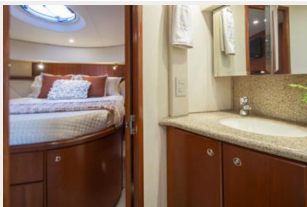
Master Stateroom Head