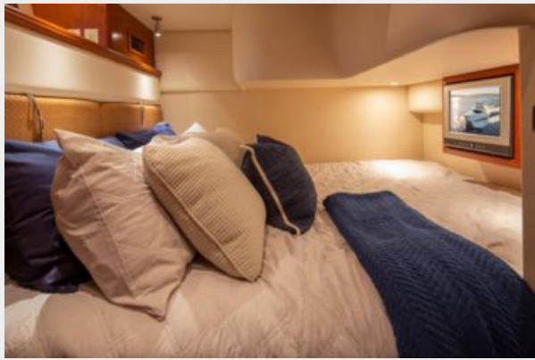
Starboard Guest Stateroom