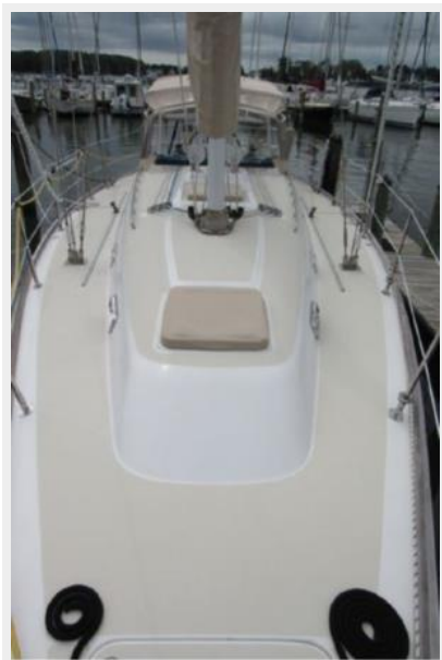
Deck looking aft