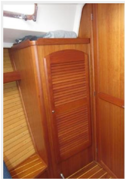
Starboard storage forward cabin