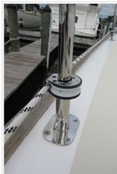
Static furler block