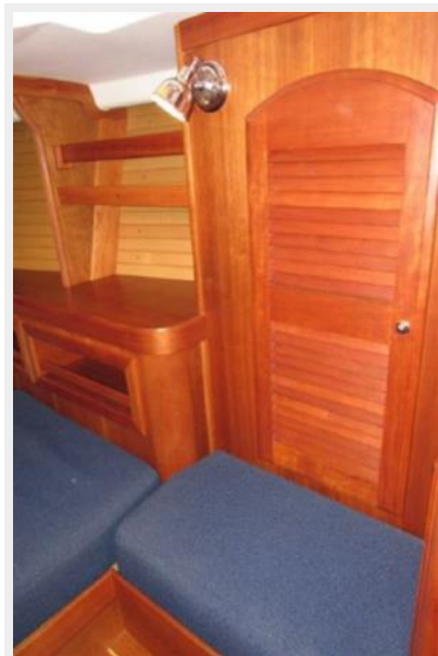
Aft cabin storage