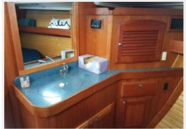
Vanity in forward cabin