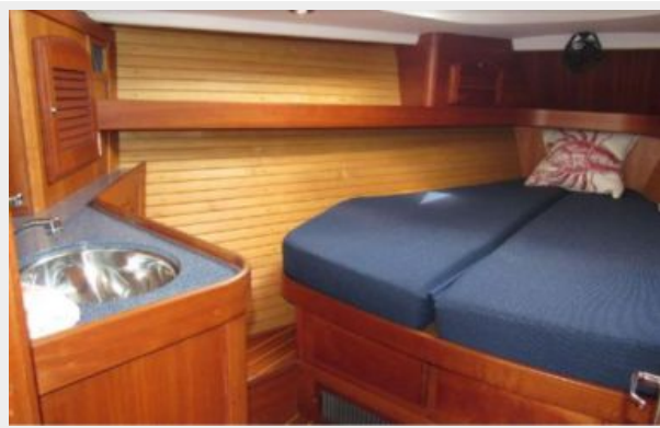
Forward cabin, port