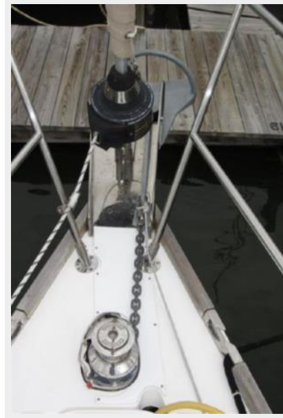
Bow locker with spare anchor and wash down