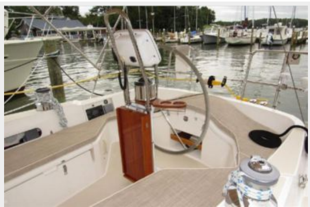
Cockpit showing table and instrument pod