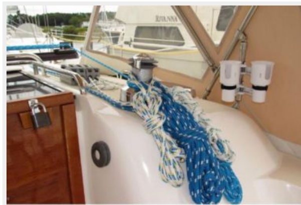
Starboard coaming and side deck