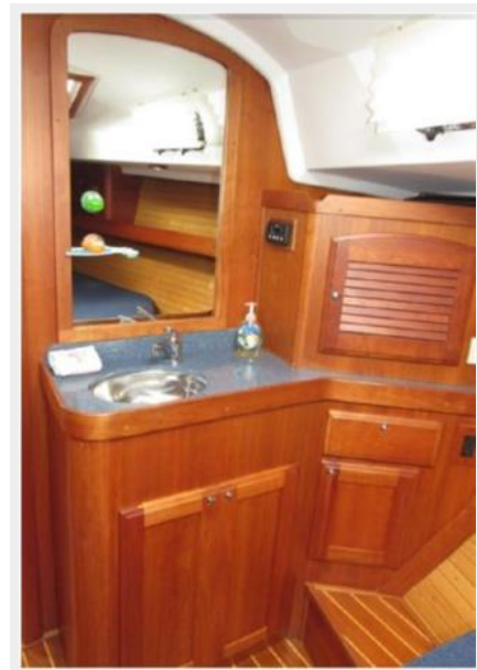
Vanity and storage