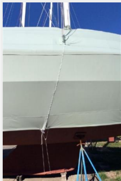
Fairclough winter cover