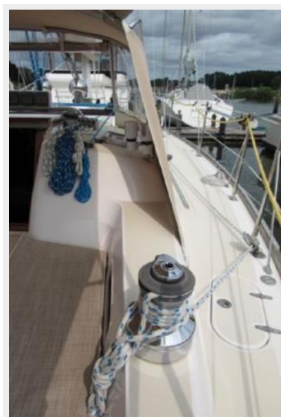
Starboard coaming and side deck