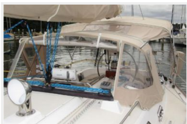
Cockpit with table up