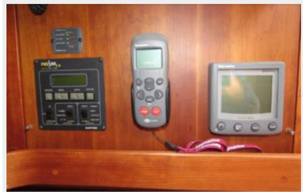
Instruments at nav station