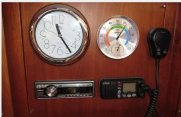
Clock, barometer, VHF and stereo