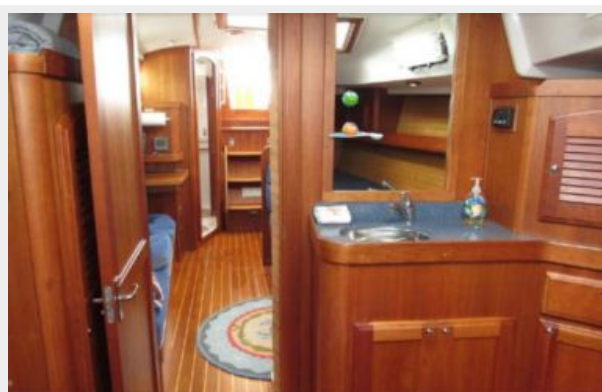
Forward cabin looking to salon