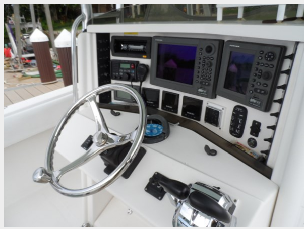
Outta Here - tournament-yacht-sales (15)