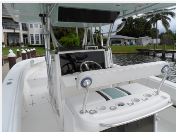
Outta Here - tournament-yacht-sales (11)