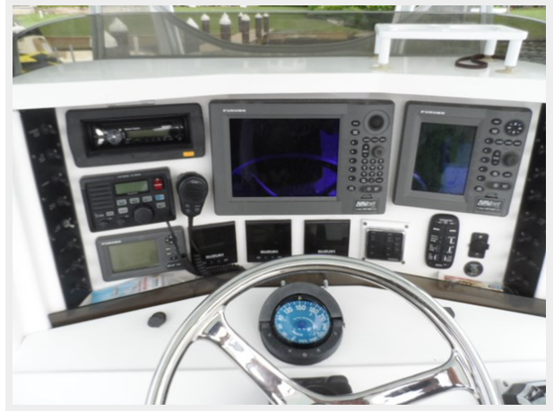
Outta Here - tournament-yacht-sales (14)