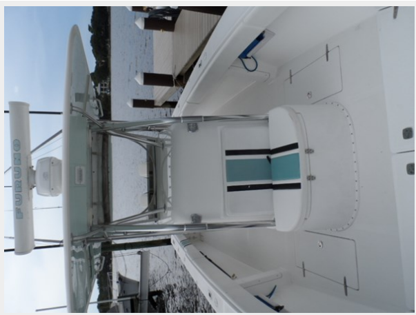
Outta Here - tournament-yacht-sales (3)