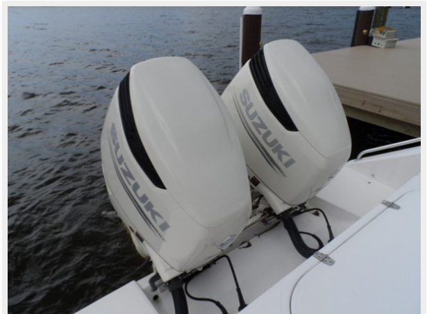
Outta Here - tournament-yacht-sales (10)