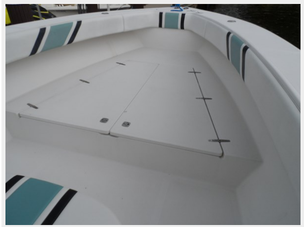
Outta Here - tournament-yacht-sales (2)