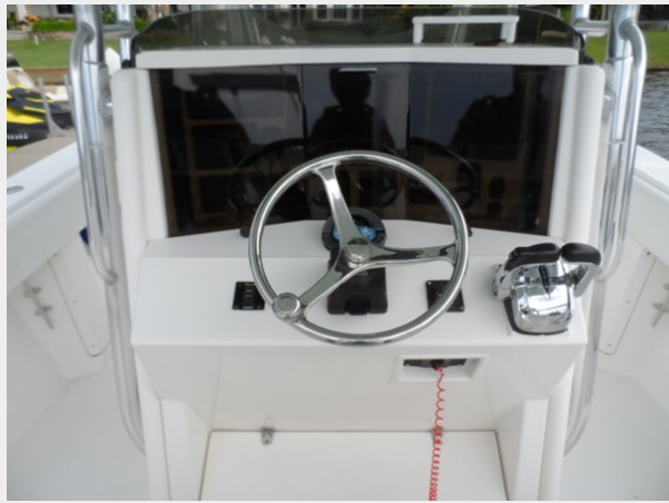
Outta Here - tournament-yacht-sales (7)