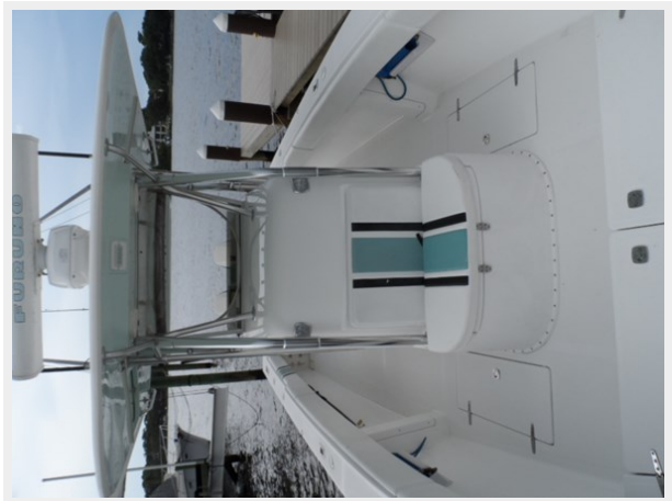
Outta Here - tournament-yacht-sales (4)