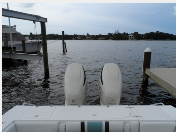
Outta Here - tournament-yacht-sales (9)