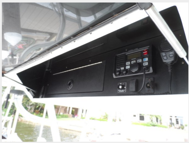
Outta Here - tournament-yacht-sales (1)