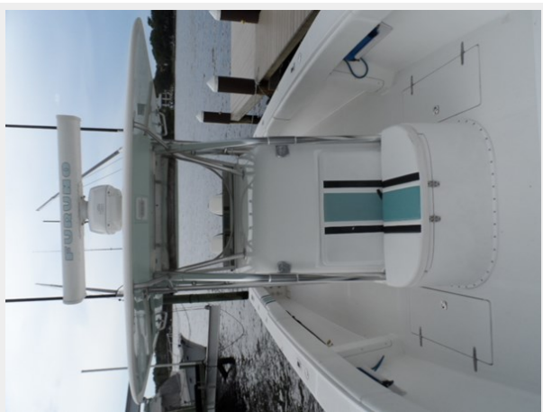
Outta Here - tournament-yacht-sales (5)