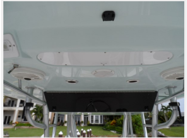
Outta Here - tournament-yacht-sales (8)