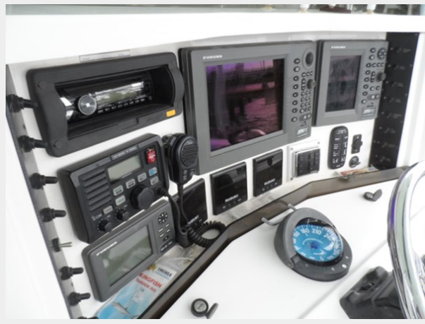
Outta Here - tournament-yacht-sales (13)