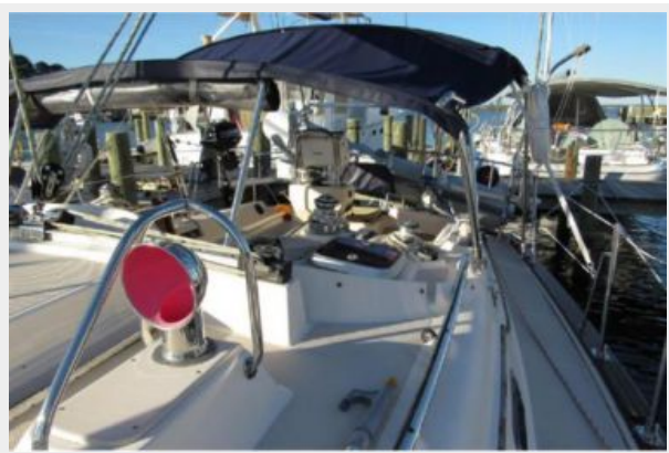
Dorades and traveller, dodger setup