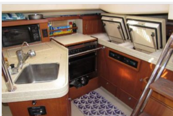
Galley with fridge and freezer open