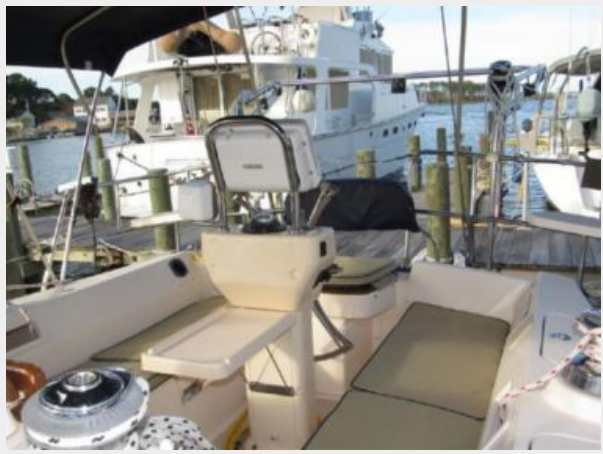
Cockpit looking aft