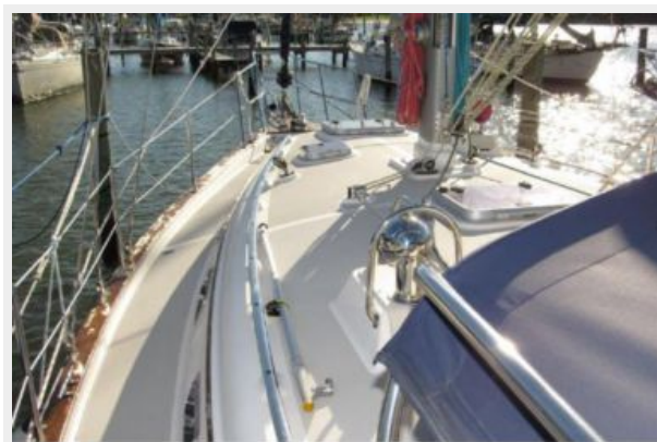
Port side deck and side grab bar on dodger