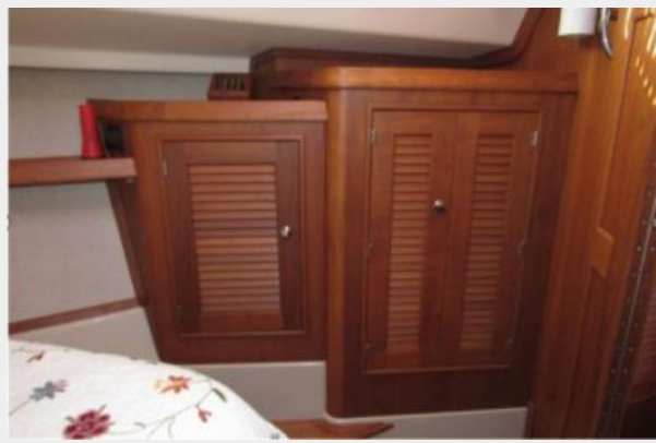
Storage in forward cabin