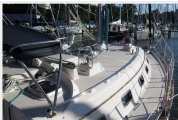
Side deck and coachroof hand holds