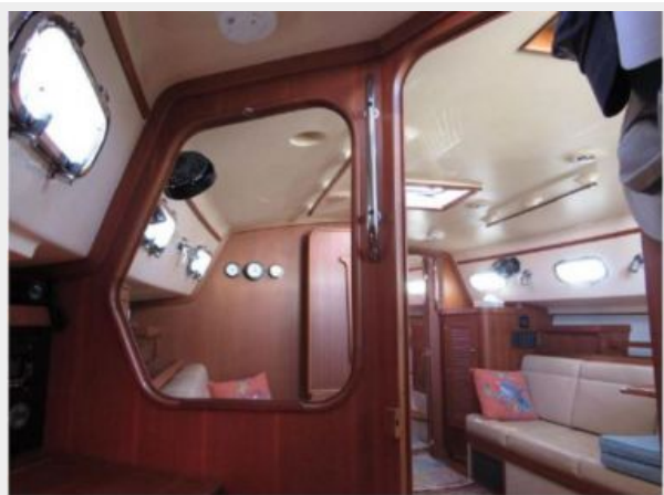
"Window" in aft bulkhead removed