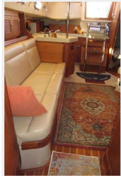
Starboard settee and galley