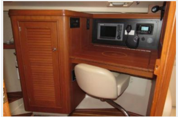
Storage and nav station in aft cabin