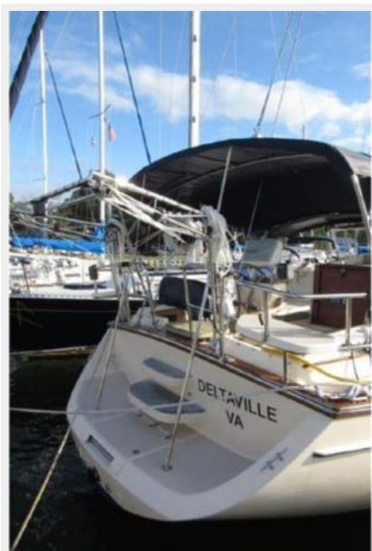
Swim platform and transom steps