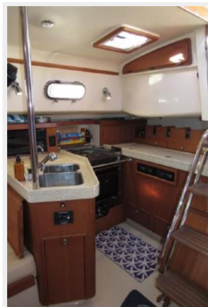
Galley with fridge and freezer closed