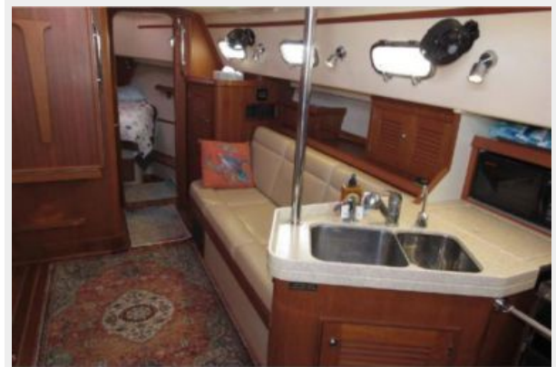
Galley with fridge and freezer closed