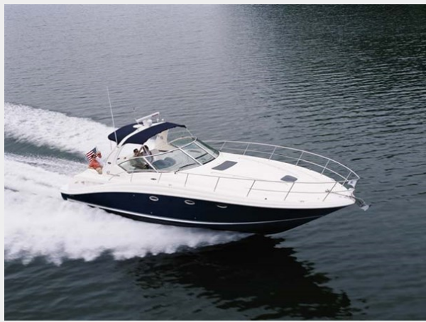
sister ship running