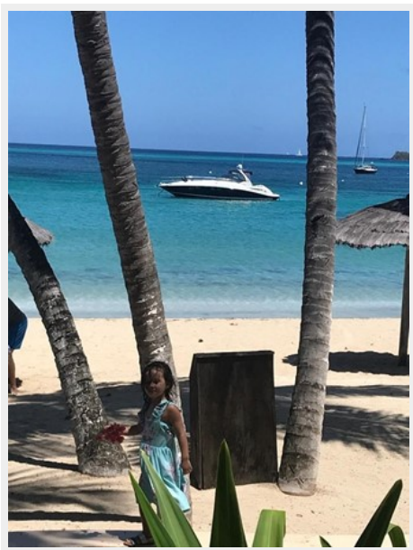
Perfectly framed actual boat