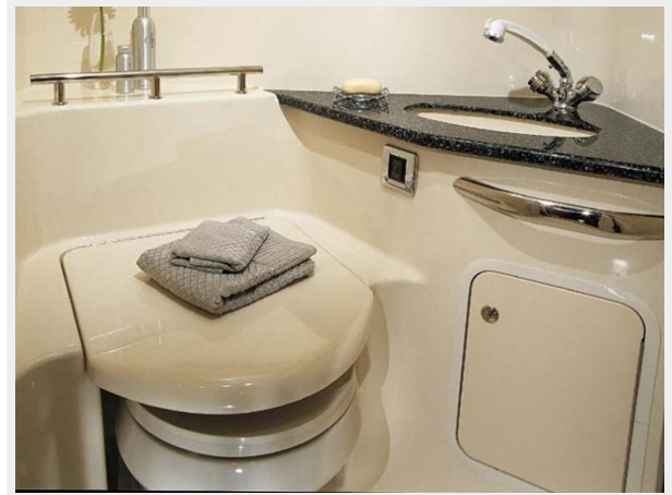
Second head and toilet