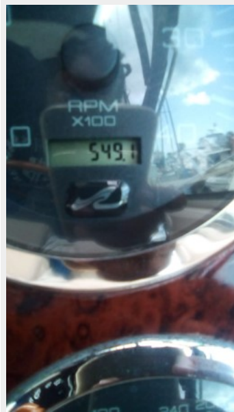
Starboard engine 8/9/2019