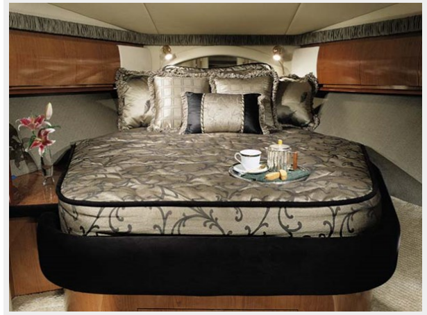
Full-size Pedestal Bed