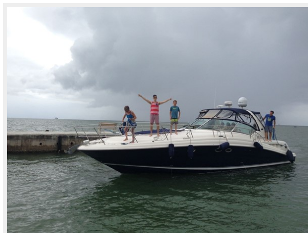
Hey guys - the party is over here! actual boat