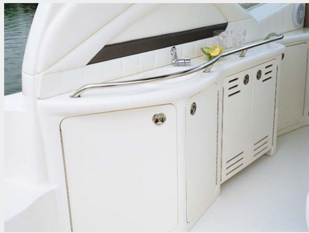
Great for cold drinks while cruising