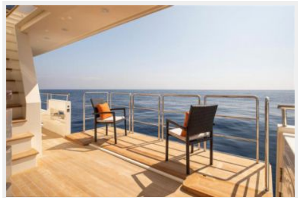
Fold down deck