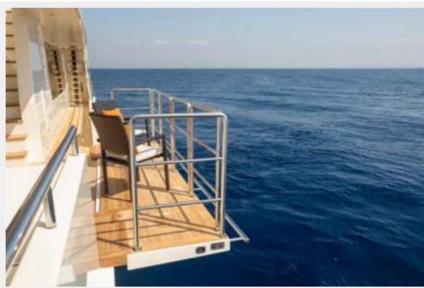
Fold down seating