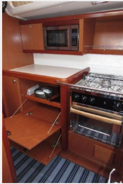
Galley storage and ovens