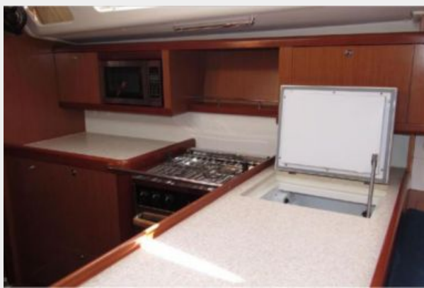
Galley with freezer lid open