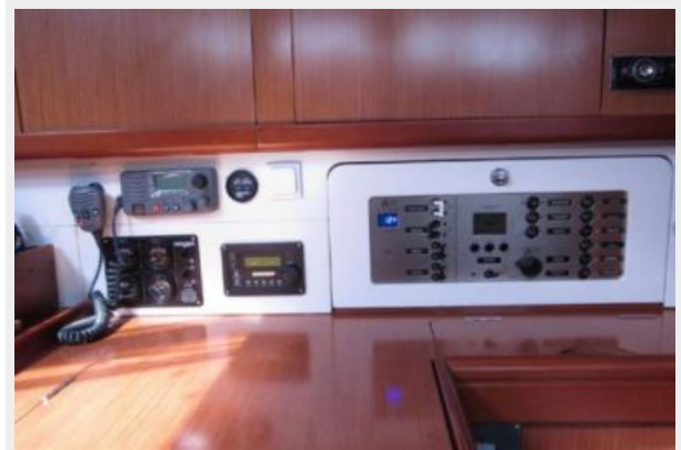
DC Electrical panel and instruments at nav station