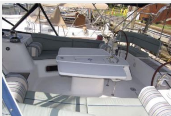
Cockpit table extended