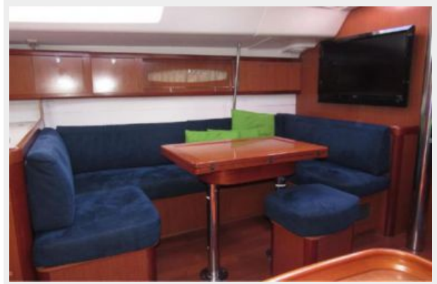
Dinette with table folded