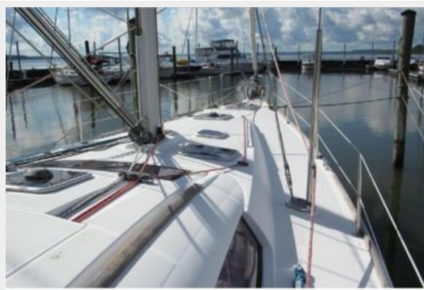
Mast base and standing rigging attachment