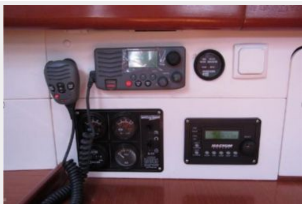
Instruments and gauges at nav station