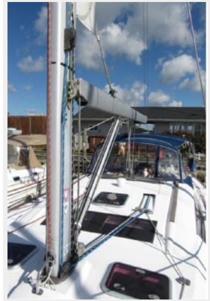
Coach roof from mast