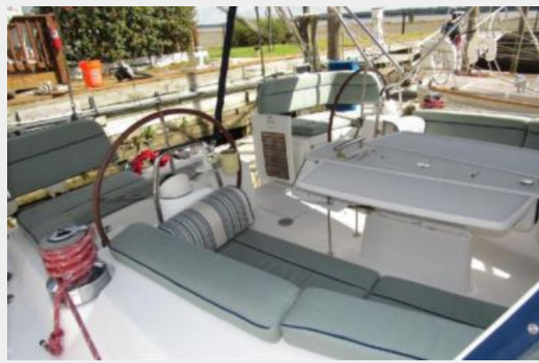
Cockpit looking aft