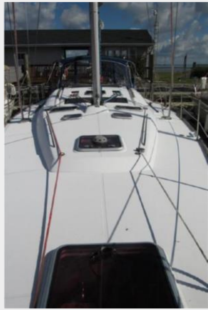
Deck from bow