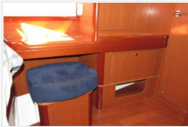
Desk in forward cabin