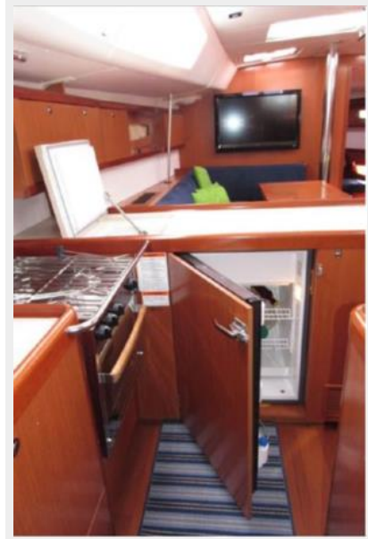
Galley - fridge and freezer access