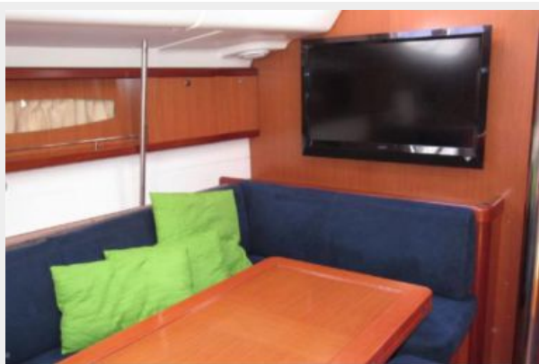
TV in salon