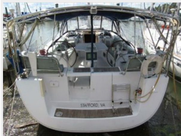
Arch, davits and bimini