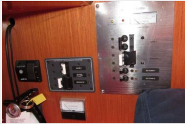
AC electrical panels