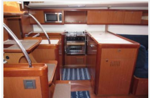
Double sink, companionway w/ countertop below