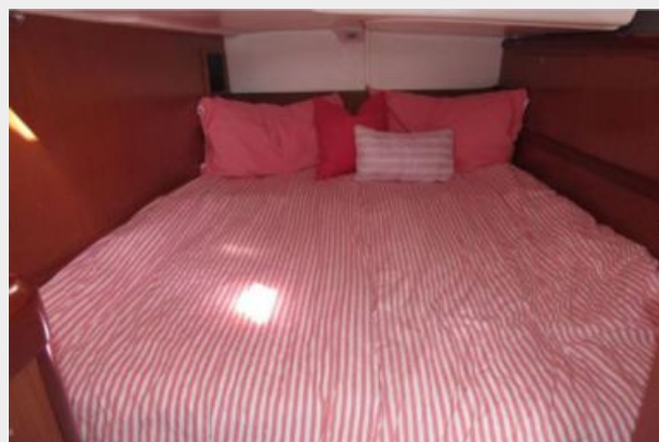
Port aft cabin