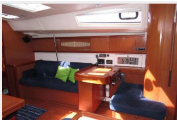
Starboard settee and nav station