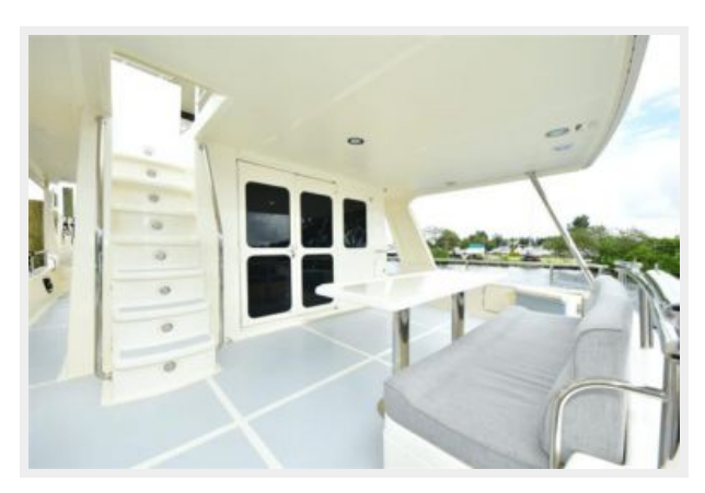
Cockpit looking Forward