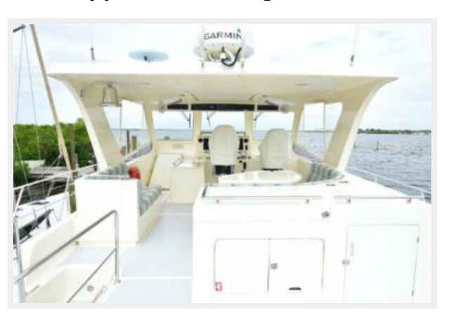
Upper Deck Grill/Sink/Fridge