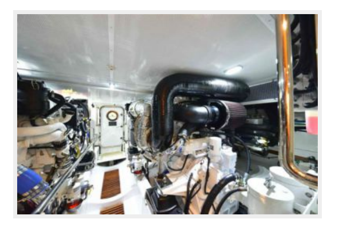
Bow facing Aft