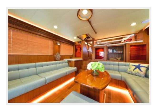
Salon Settee Portside