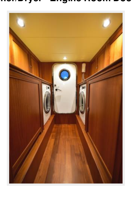
Washer/Dryer - Engine Room Door Aft