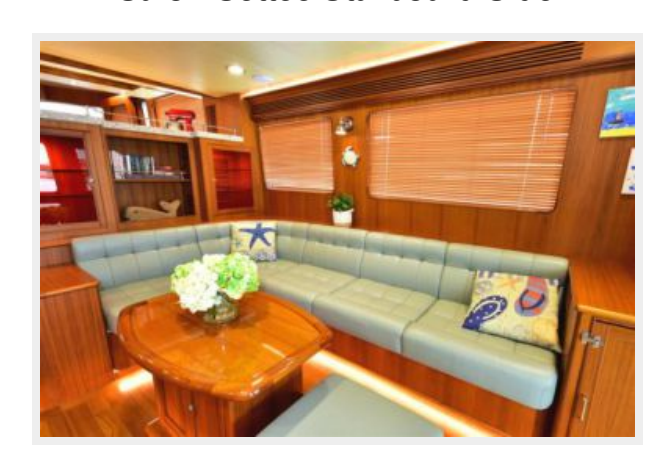
Salon Settee Starboard Side