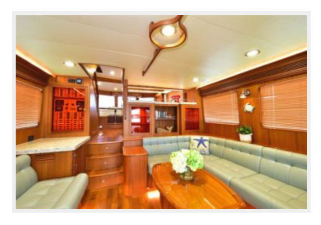
Salon facing Forward