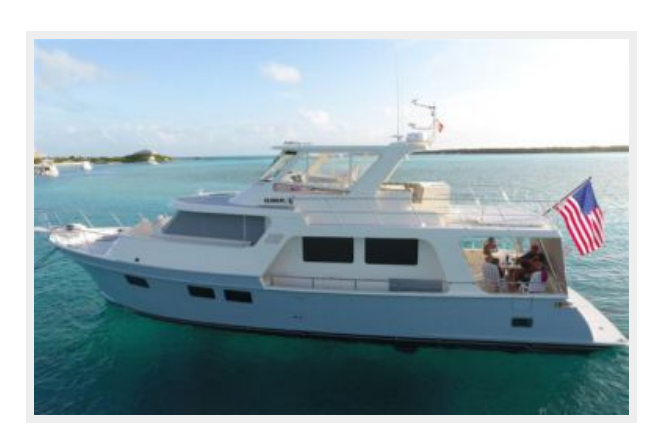
Profile In Lieu Of...