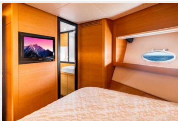
64 Pershing 2010 - 6