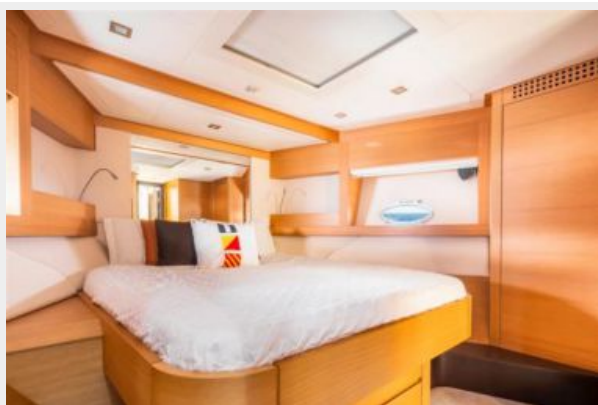
64 Pershing 2010 - 4