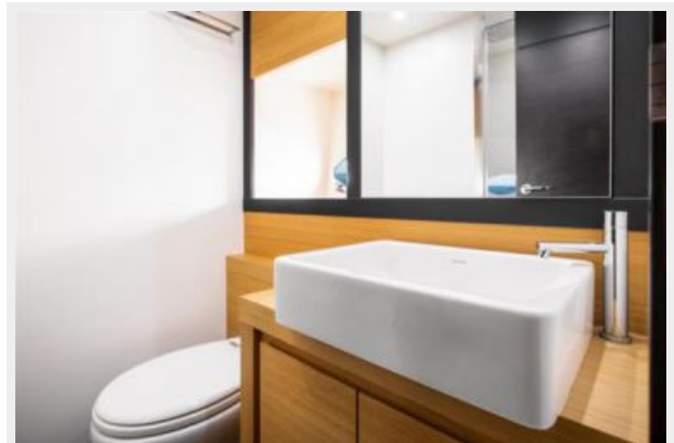
64 Pershing 2010 - 5