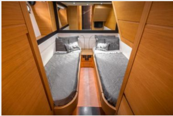
64 Pershing 2010 - 8