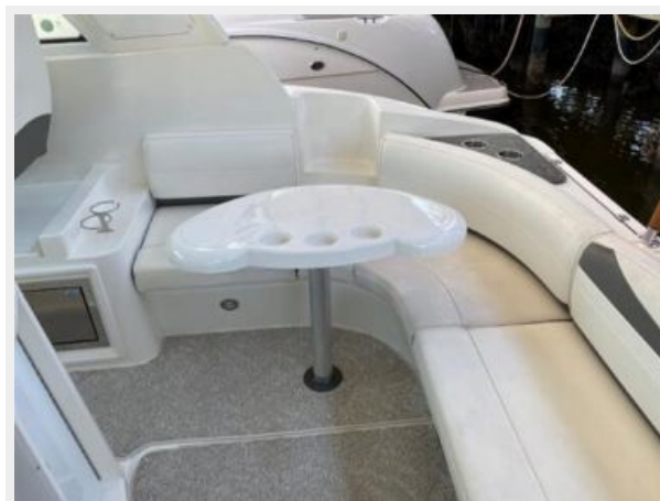
Aft Cockpit looking Starboard