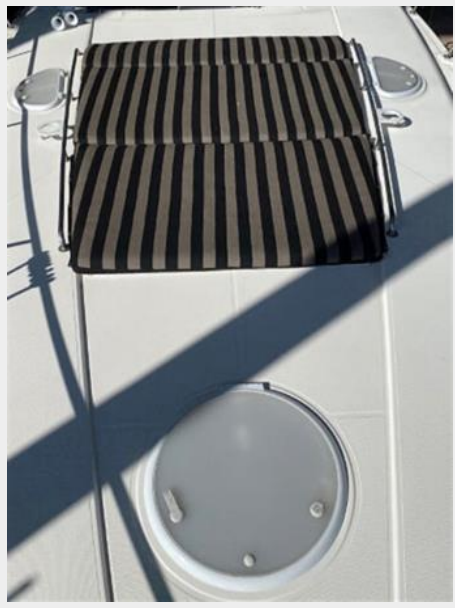
Bow looking Aft