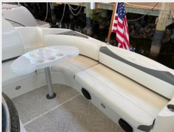
Aft Cockpit Seating