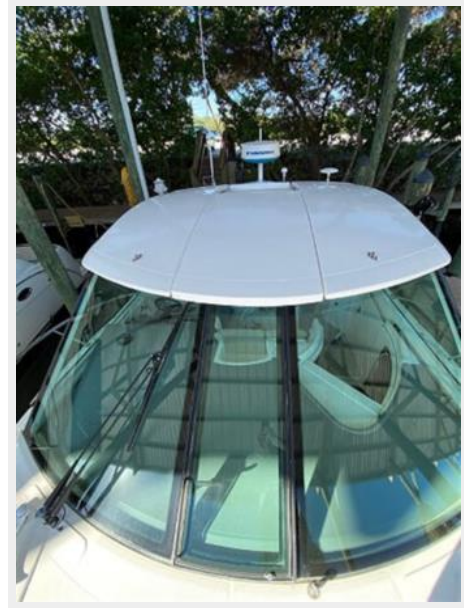
Full Windshield with Opening Passthrough