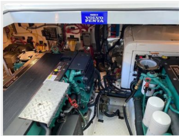
Engine Room looking Starboard