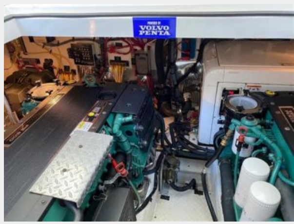
Engine Room looking Starboard