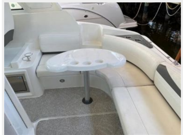
Aft Cockpit looking Starboard