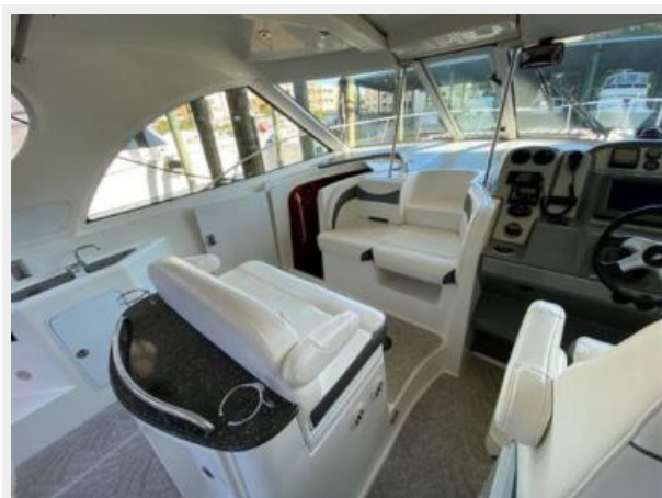
Cockpit & Helm Seating