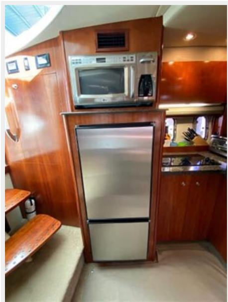
Galley looking Port