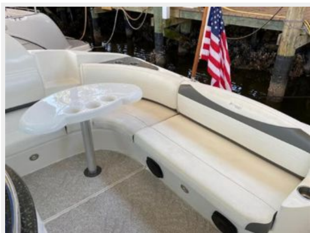
Aft Cockpit Seating