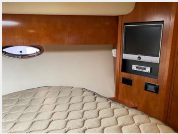
Stateroom TV & DVD