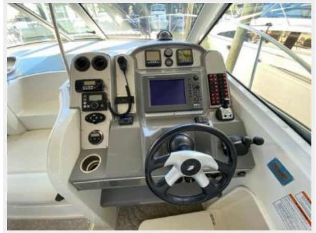
Sunroof & Passthrough to Bow