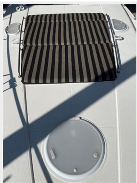
Bow looking Aft