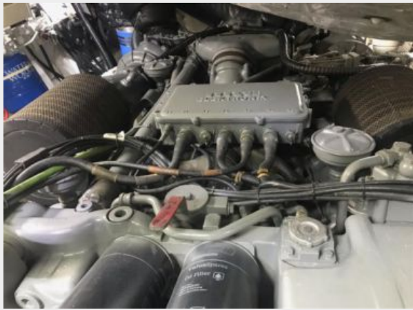
42_2000 74ft Baia MAGNIFICA