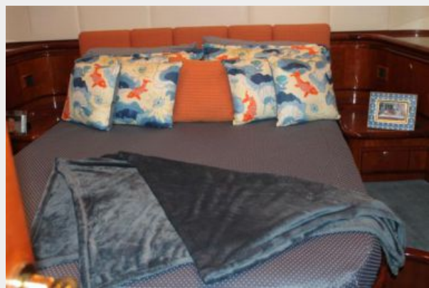
22_2000 74ft Baia MAGNIFICA