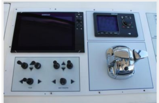
15_2000 74ft Baia MAGNIFICA