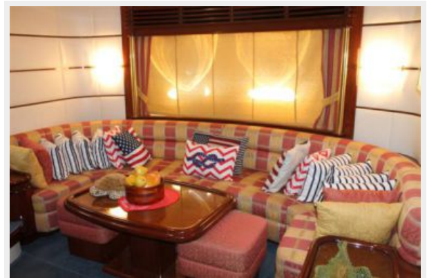
17_2000 74ft Baia MAGNIFICA