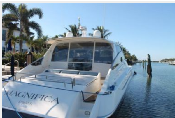
40_2000 74ft Baia MAGNIFICA