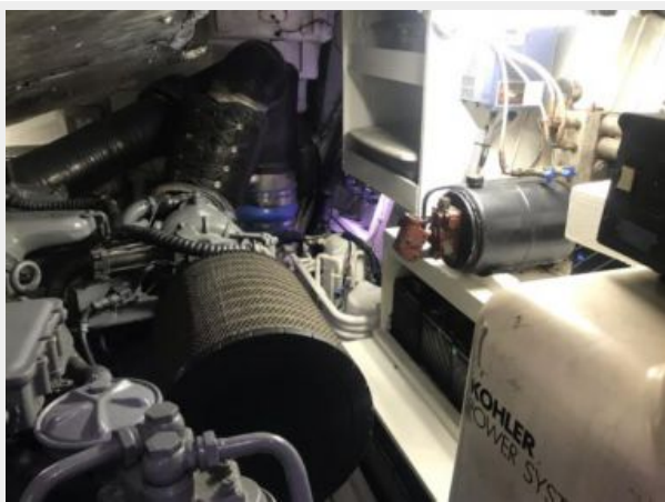
44_2000 74ft Baia MAGNIFICA