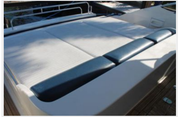
3_2000 74ft Baia MAGNIFICA