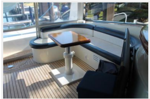
5_2000 74ft Baia MAGNIFICA