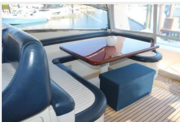
6_2000 74ft Baia MAGNIFICA