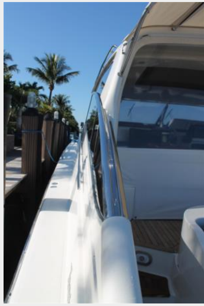
2_2000 74ft Baia MAGNIFICA