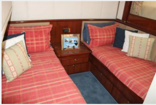
32_2000 74ft Baia MAGNIFICA