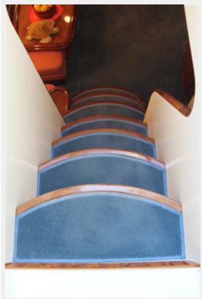
16_2000 74ft Baia MAGNIFICA