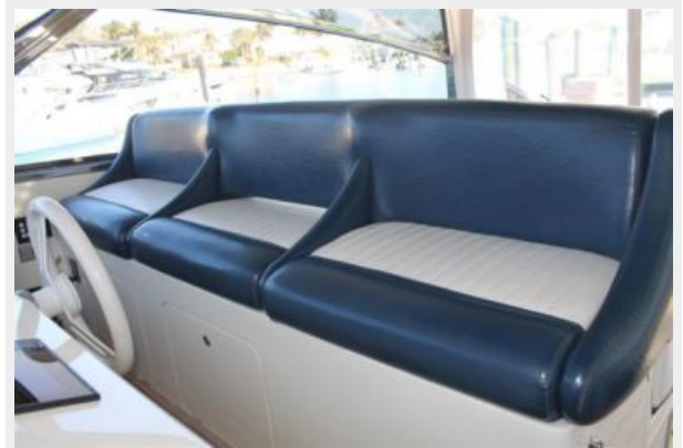
11_2000 74ft Baia MAGNIFICA