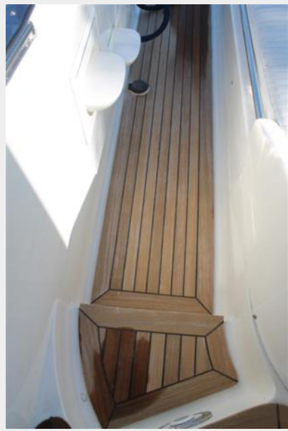
36_2000 74ft Baia MAGNIFICA