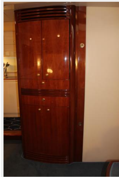
21_2000 74ft Baia MAGNIFICA