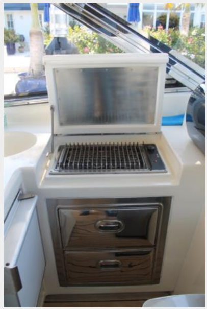
8_2000 74ft Baia MAGNIFICA