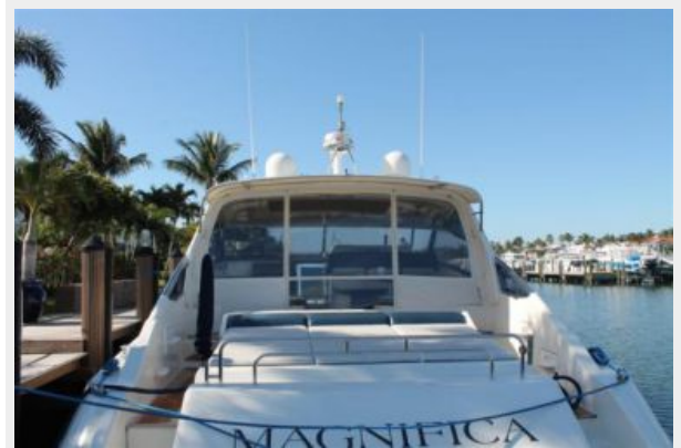
39_2000 74ft Baia MAGNIFICA