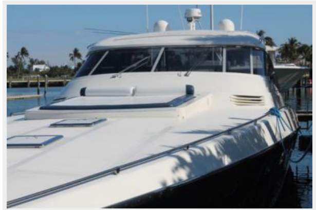
37_2000 74ft Baia MAGNIFICA