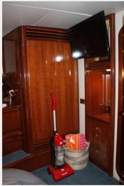
24_2000 74ft Baia MAGNIFICA