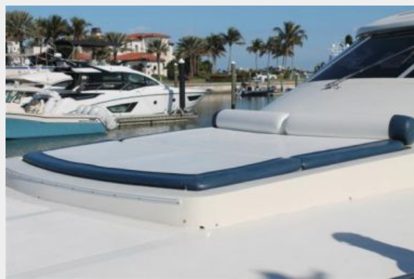
38_2000 74ft Baia MAGNIFICA