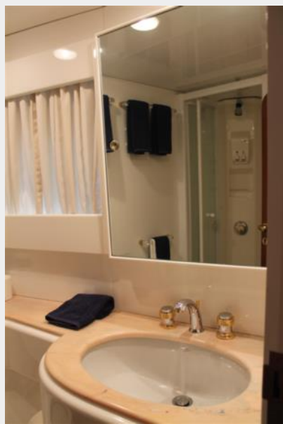
26_2000 74ft Baia MAGNIFICA