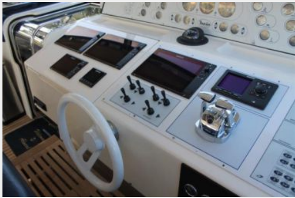
14_2000 74ft Baia MAGNIFICA