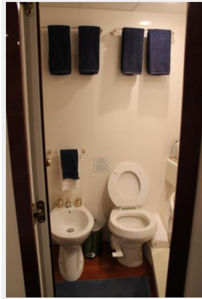
25_2000 74ft Baia MAGNIFICA