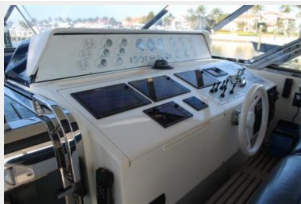
12_2000 74ft Baia MAGNIFICA