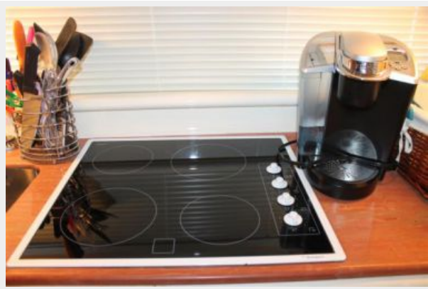
20_2000 74ft Baia MAGNIFICA