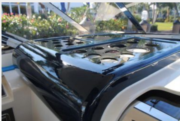
10_2000 74ft Baia MAGNIFICA