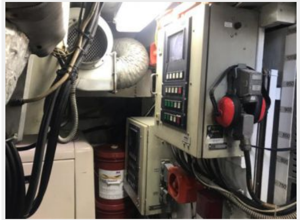
43_2000 74ft Baia MAGNIFICA