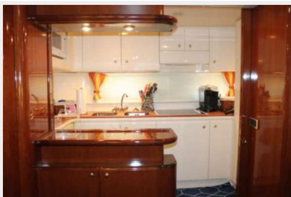
18_2000 74ft Baia MAGNIFICA