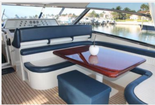
4_2000 74ft Baia MAGNIFICA