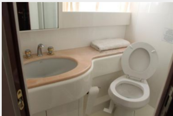
34_2000 74ft Baia MAGNIFICA