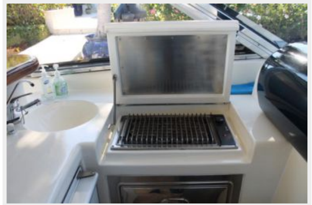
9_2000 74ft Baia MAGNIFICA