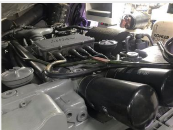
46_2000 74ft Baia MAGNIFICA