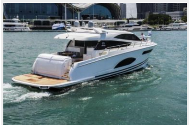
Main Deck View