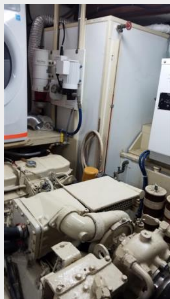
38__ 1988 53ft Defever 53 POC HIS AND HERS