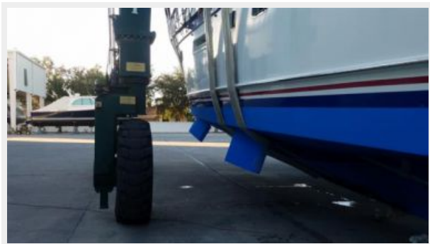
8__1988 53ft Defever 53 POC HIS AND HERS