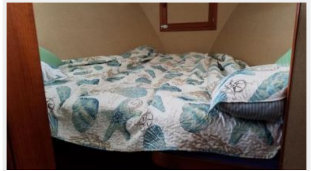
29__1988 53ft Defever 53 POC HIS AND HERS