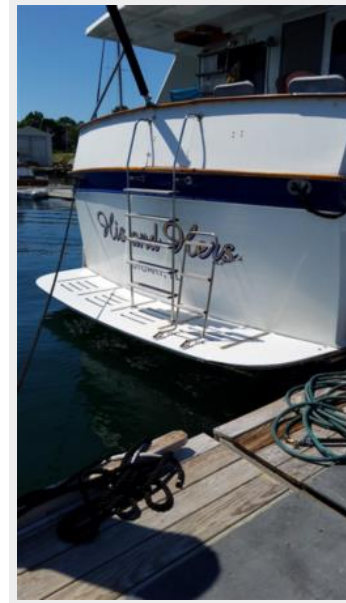
7__1988 53ft Defever 53 POC HIS AND HERS