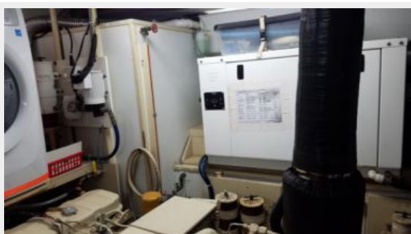
32__1988 53ft Defever 53 POC HIS AND HERS