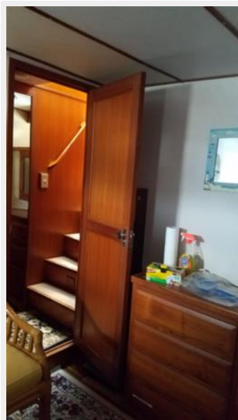
26__1988 53ft Defever 53 POC HIS AND HERS