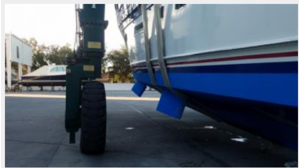
8__1988 53ft Defever 53 POC HIS AND HERS