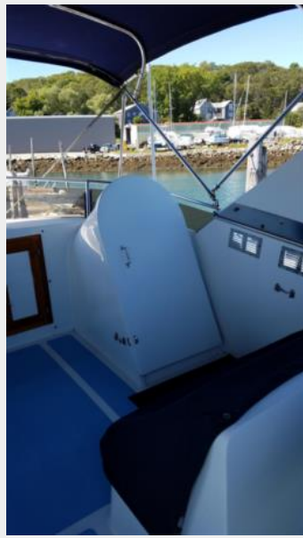
18__1988 53ft Defever 53 POC HIS AND HERS