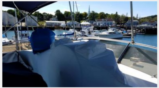
13__1988 53ft Defever 53 POC HIS AND HERS