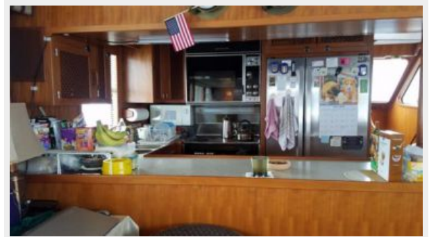
21__1988 53ft Defever 53 POC HIS AND HERS