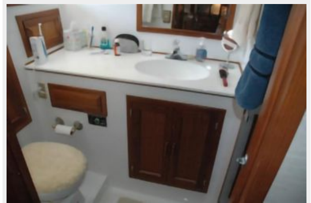
31__1988 53ft Defever 53 POC HIS AND HERS