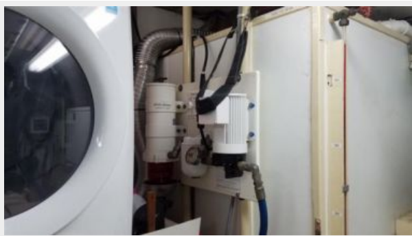
36__ 1988 53ft Defever 53 POC HIS AND HERS