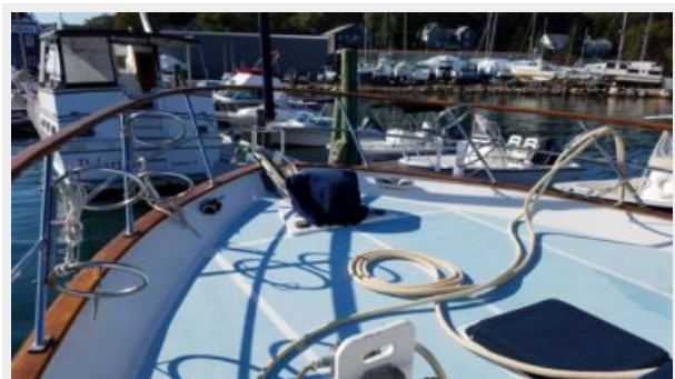
10__1988 53ft Defever 53 POC HIS AND HERS