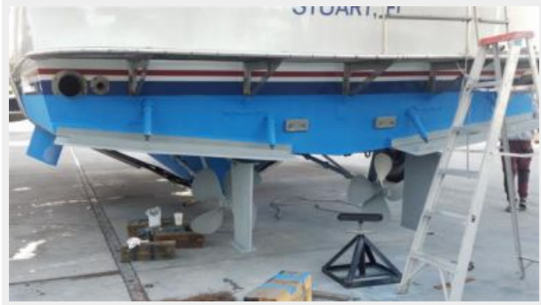
6__1988 53ft Defever 53 POC HIS AND HERS