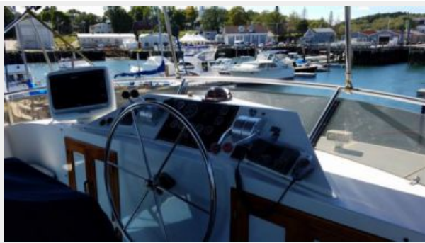
14__1988 53ft Defever 53 POC HIS AND HERS