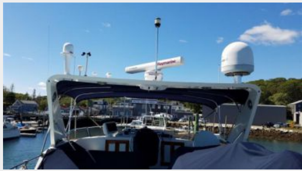
12__1988 53ft Defever 53 POC HIS AND HERS