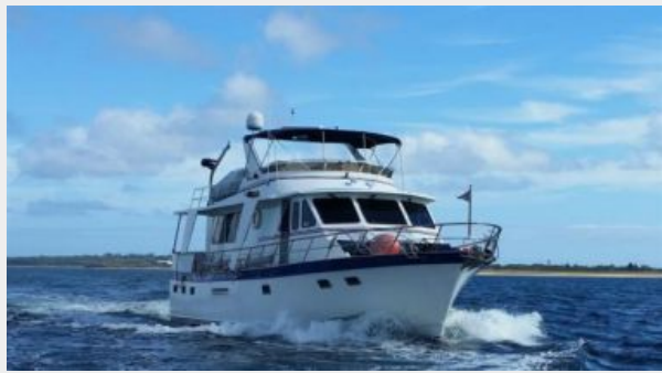
2__1988 53ft Defever 53 POC HIS AND HERS