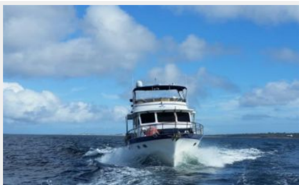
4__1988 53ft Defever 53 POC HIS AND HERS