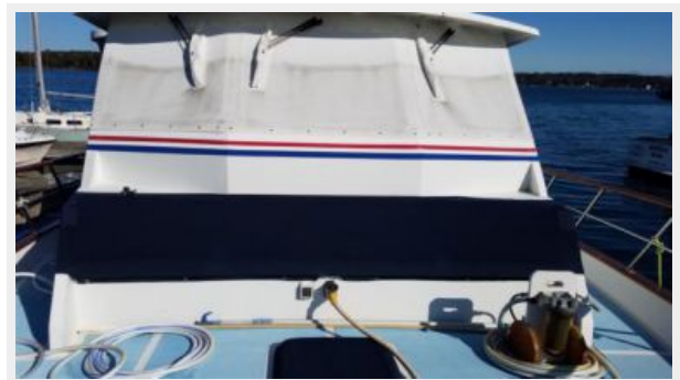
9__1988 53ft Defever 53 POC HIS AND HERS