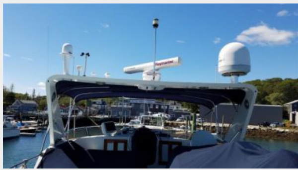
12__1988 53ft Defever 53 POC HIS AND HERS