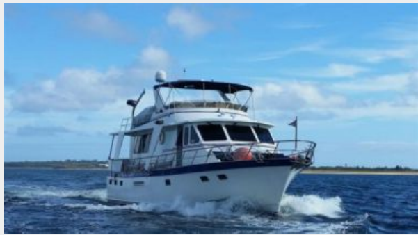
2__1988 53ft Defever 53 POC HIS AND HERS