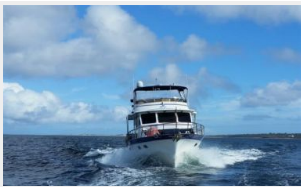
4__1988 53ft Defever 53 POC HIS AND HERS