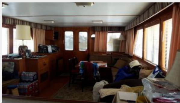
20__1988 53ft Defever 53 POC HIS AND HERS