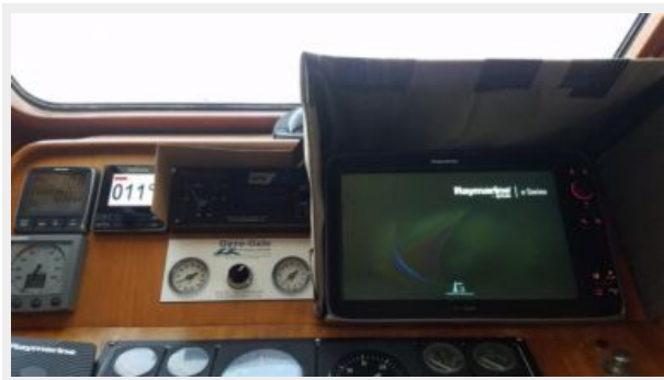
24__1988 53ft Defever 53 POC HIS AND HERS