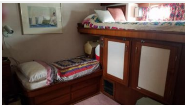
30__1988 53ft Defever 53 POC HIS AND HERS