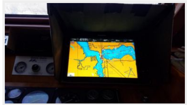
25__1988 53ft Defever 53 POC HIS AND HERS