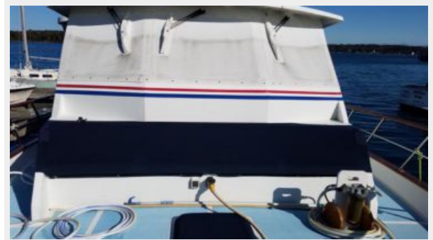
9__1988 53ft Defever 53 POC HIS AND HERS