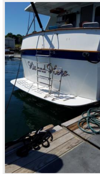
7__1988 53ft Defever 53 POC HIS AND HERS