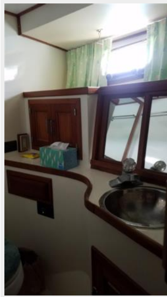
28__1988 53ft Defever 53 POC HIS AND HERS