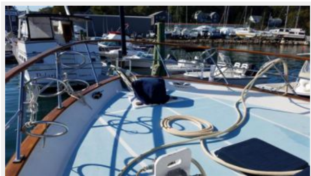
10__1988 53ft Defever 53 POC HIS AND HERS