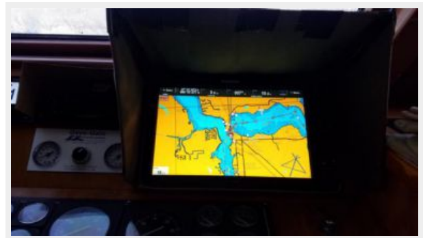
25__1988 53ft Defever 53 POC HIS AND HERS