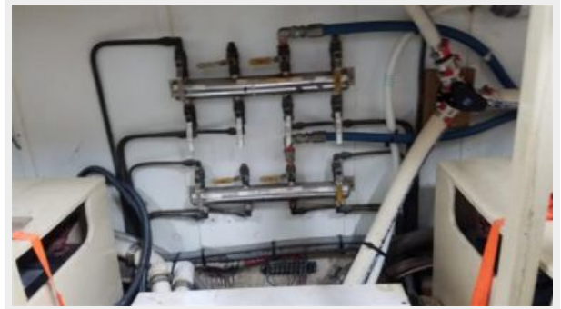
35__ 1988 53ft Defever 53 POC HIS AND HERS