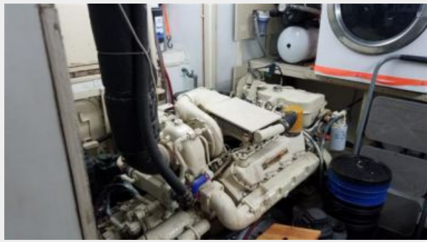
34__ 1988 53ft Defever 53 POC HIS AND HERS