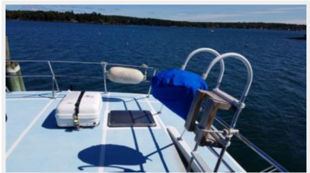
15__1988 53ft Defever 53 POC HIS AND HERS