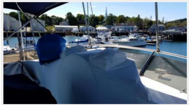
13__1988 53ft Defever 53 POC HIS AND HERS