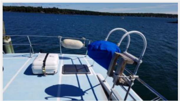
15__1988 53ft Defever 53 POC HIS AND HERS