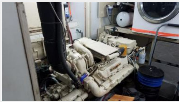
34__1988 53ft Defever 53 POC HIS AND HERS