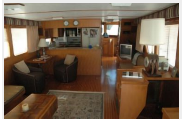
19__1988 53ft Defever 53 POC HIS AND HERS