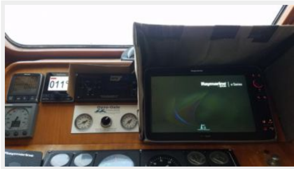
24__1988 53ft Defever 53 POC HIS AND HERS