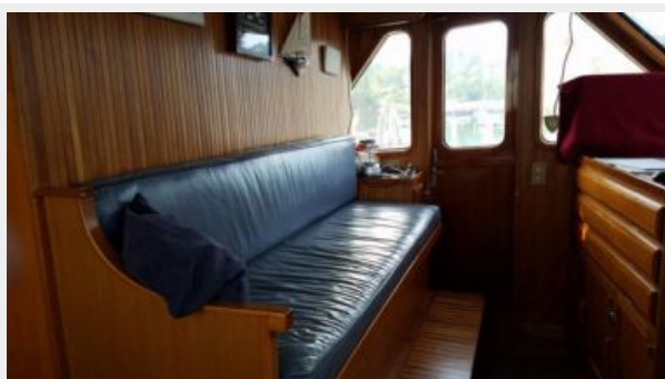
22__1988 53ft Defever 53 POC HIS AND HERS