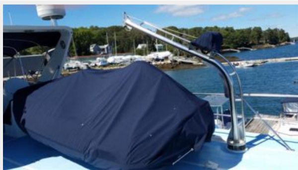
16__1988 53ft Defever 53 POC HIS AND HERS