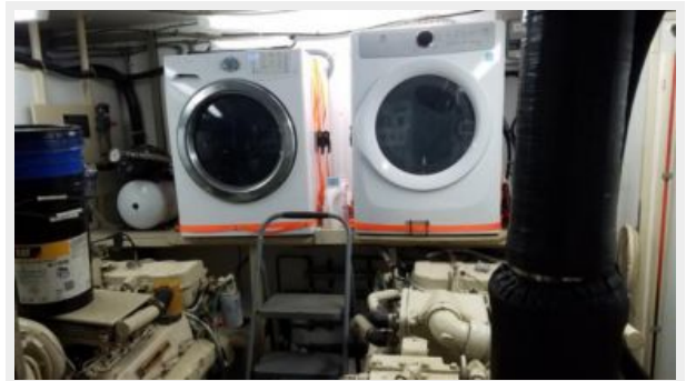
37__ 1988 53ft Defever 53 POC HIS AND HERS