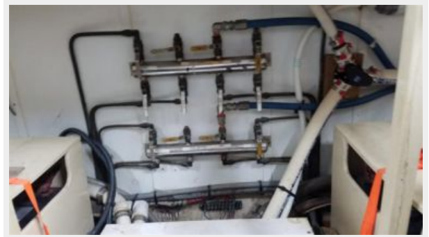
35__1988 53ft Defever 53 POC HIS AND HERS