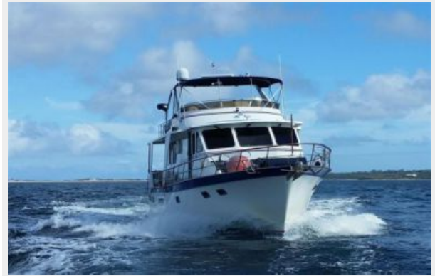
3__1988 53ft Defever 53 POC HIS AND HERS