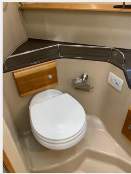
15 Head 2