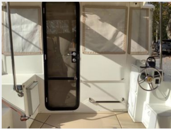
22 Cockpit Covers 2