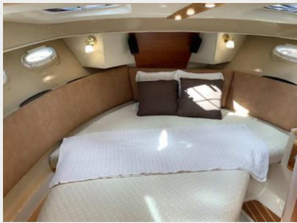
11 Master Stateroom