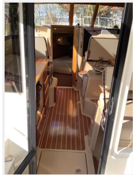
8 Centerline Door