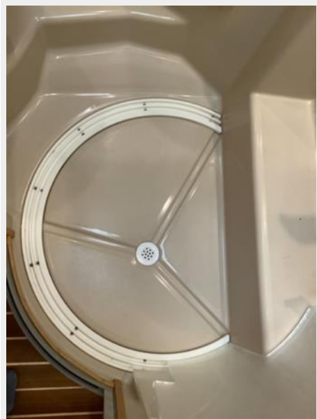
17 Head Shower