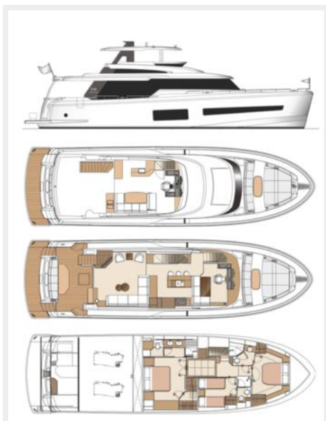
Open Bridge Layout