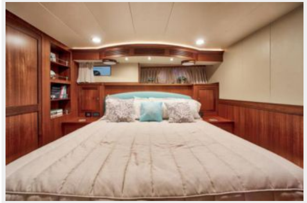
21. MASTER STATEROOM