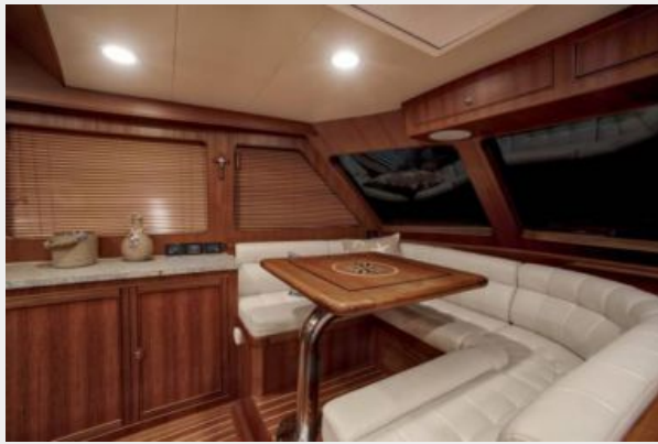
14. DINING LOOKING TO PORT