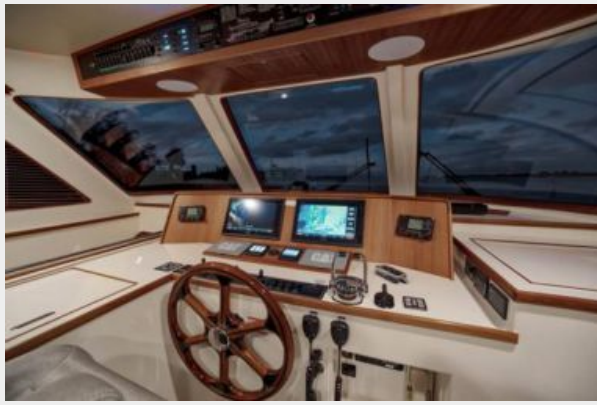
26. HELM LOOKING FORWARD