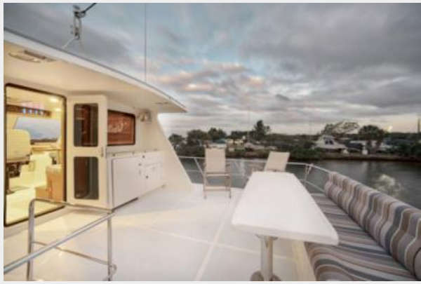
32. UPPER AFT DECK LOOKING TO STBD