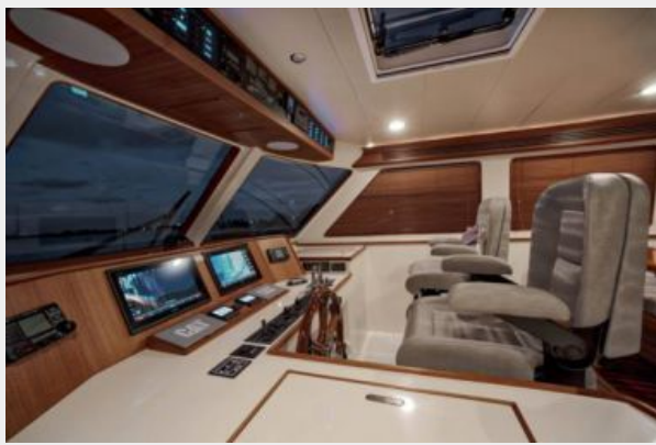
28. HELM LOOKING TO STBD