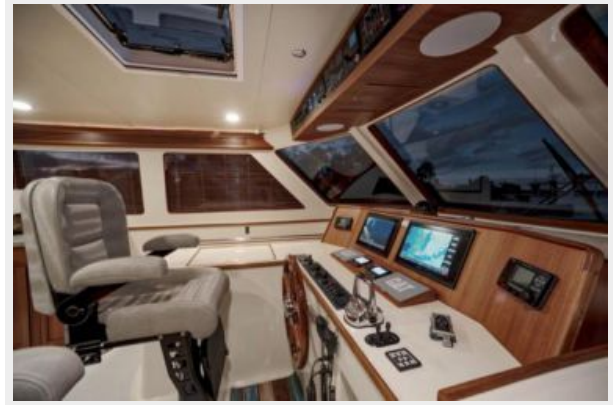
27. HELM LOOKING TO PORT