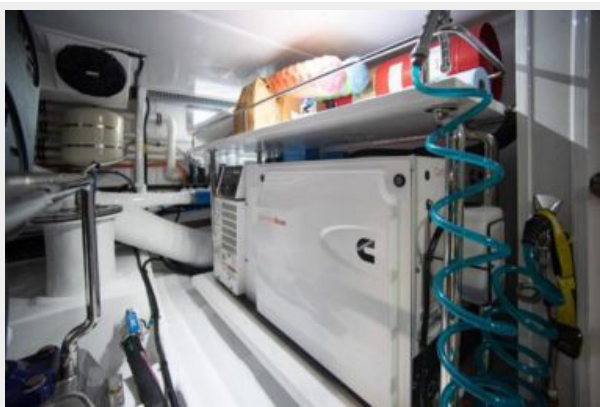
36. GENERATOR (STBD)