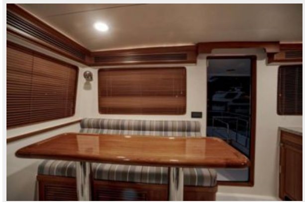
29. COMMAND BRIDGE SEATING