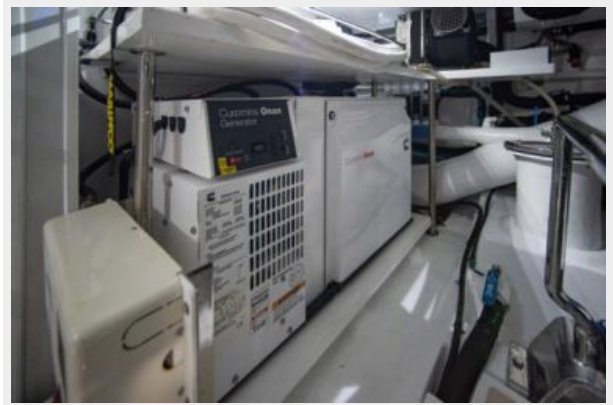
35. GENERATOR (PORT)