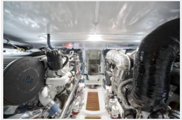
33. ENGINE ROOM