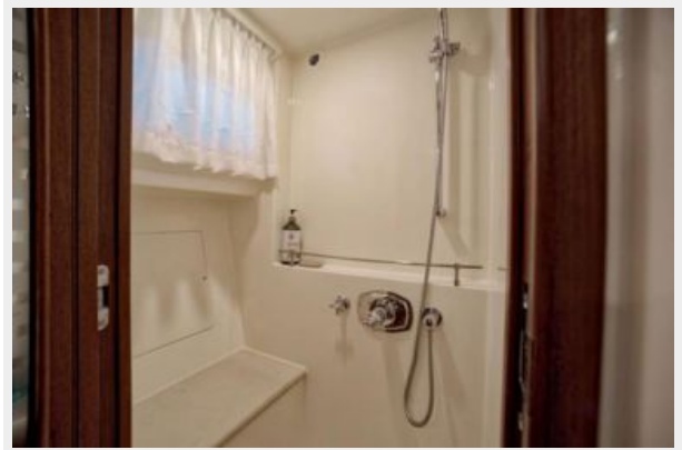
23. MASTER SHOWER