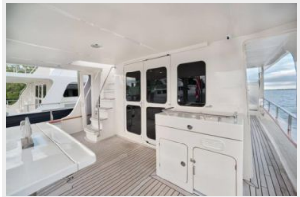
3. COCKPIT LOOKING TO PORT