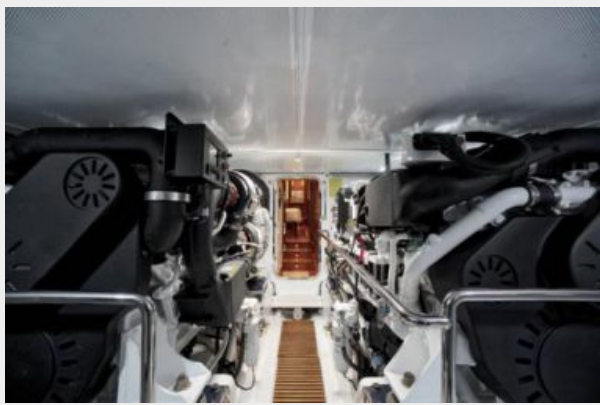
34. ENGINE ROOM LOOKING AFT