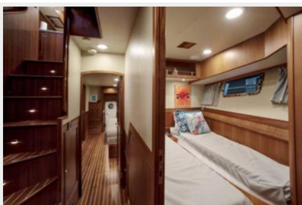
18. COMPANIONWAY LOOKING AFT