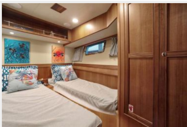
16. PORT GUEST STATEROOM LOOKING TO PORT