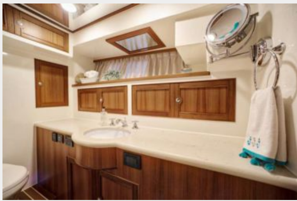
22. MASTER HEAD