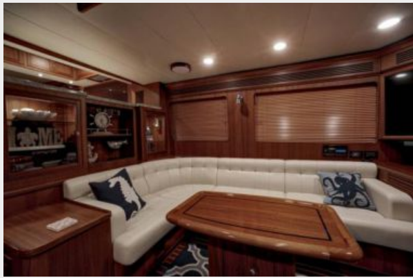
8. SALON LOOKING TO STBD