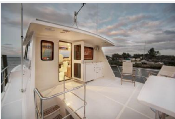
30. COMMAND BRIDGE VIEWED FROM UPPER AFT DECK