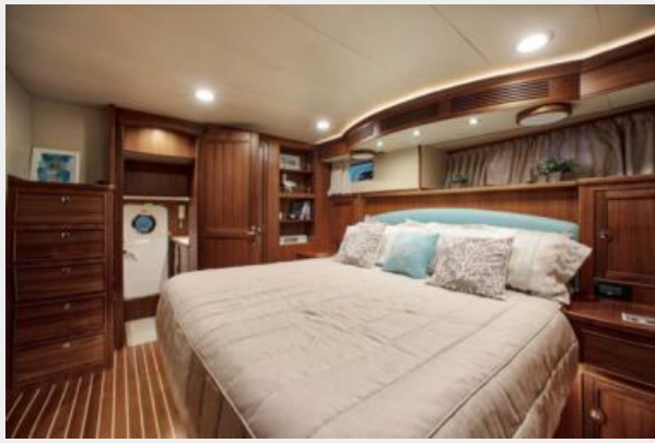
20. MASTER STATEROOM LOOKING AFT