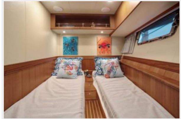
15. PORT GUEST STATEROOM