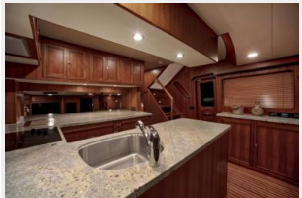
11. GALLEY COUNTERTOPS