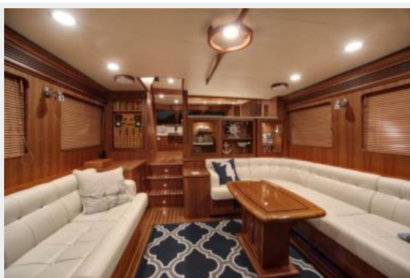
6. SALON LOOKING FORWARD