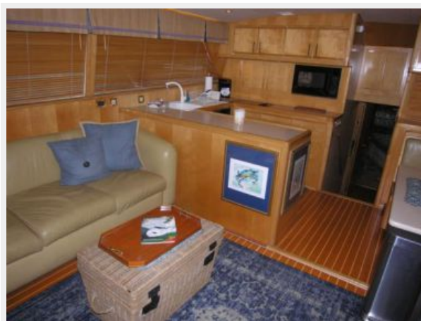
Salon / Galley