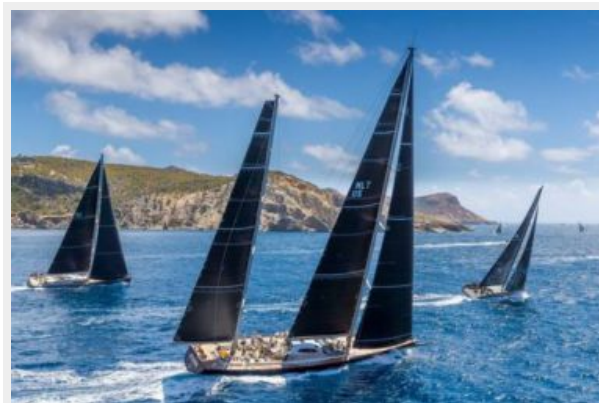
Regatta winning pedigree