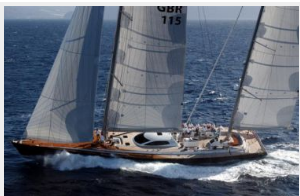
Farr Yacht Design Sojana